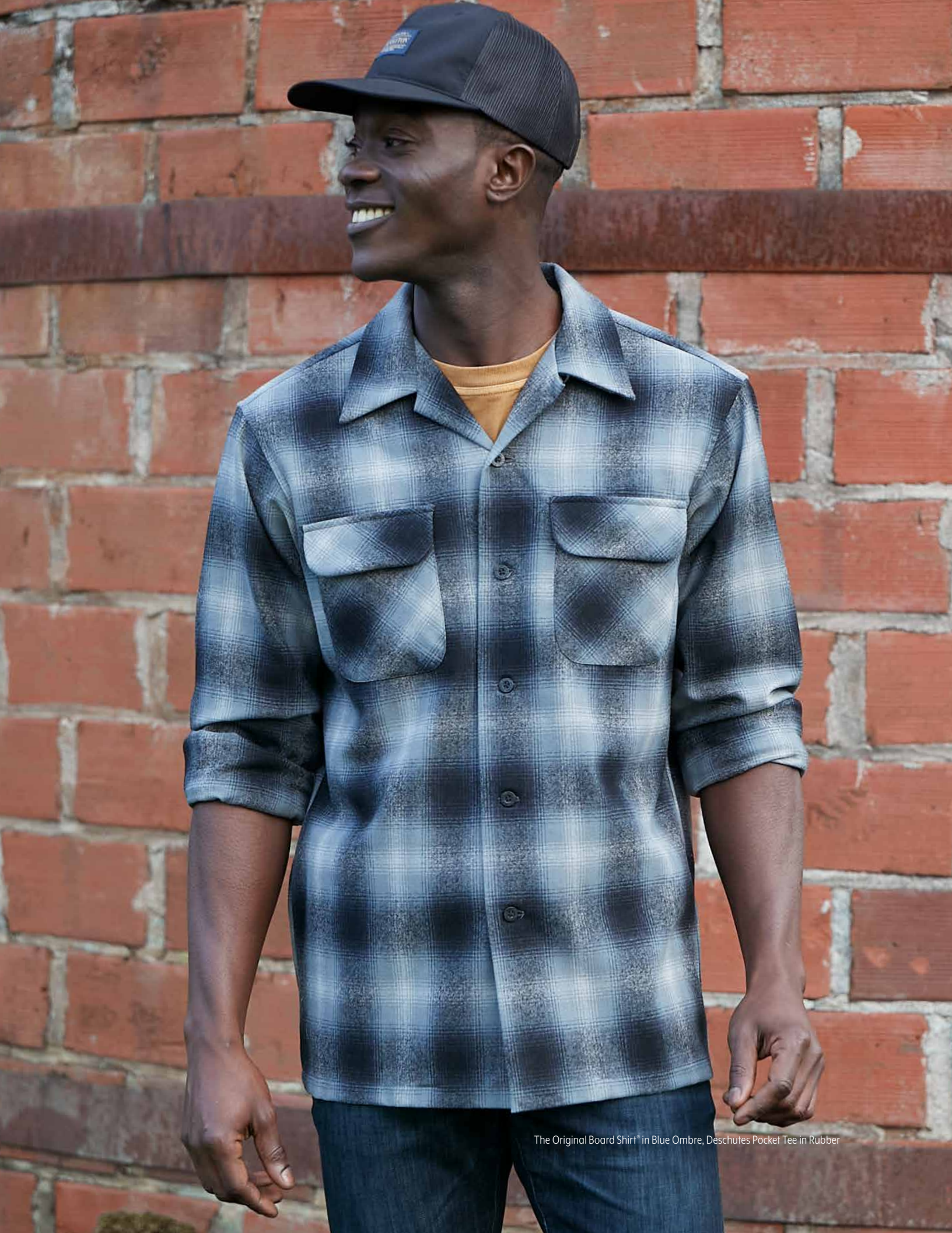
The Original Board Shirt* in Blue Ombre, Deschutes Pocket Tee in Rubber