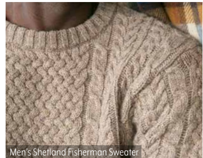
Men's Shetland Fisherman Sweater