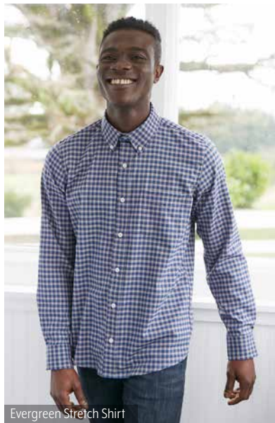
Evergreen Stretch Shirt