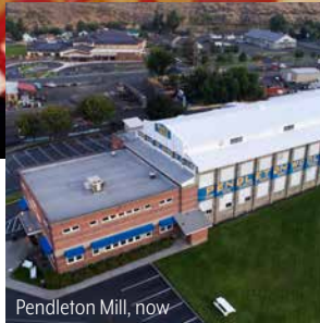
Pendleton Mill, now