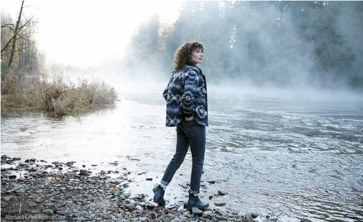
Alamosa Fitted Ripstop Coat