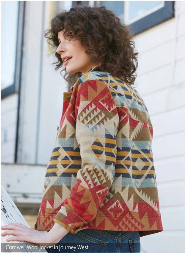
Cardwell Wool Jacket in Journey West