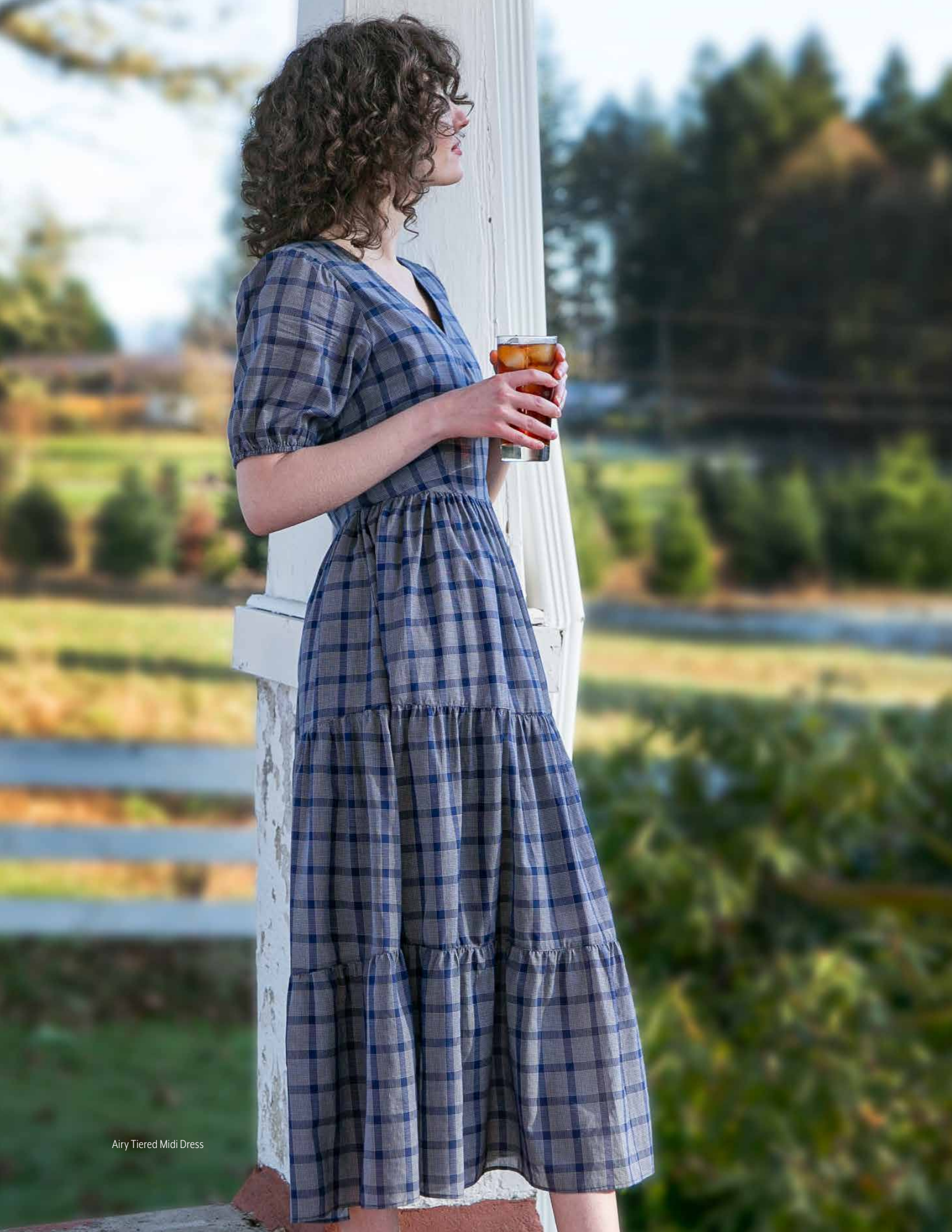
Airy Tiered Midi Dress