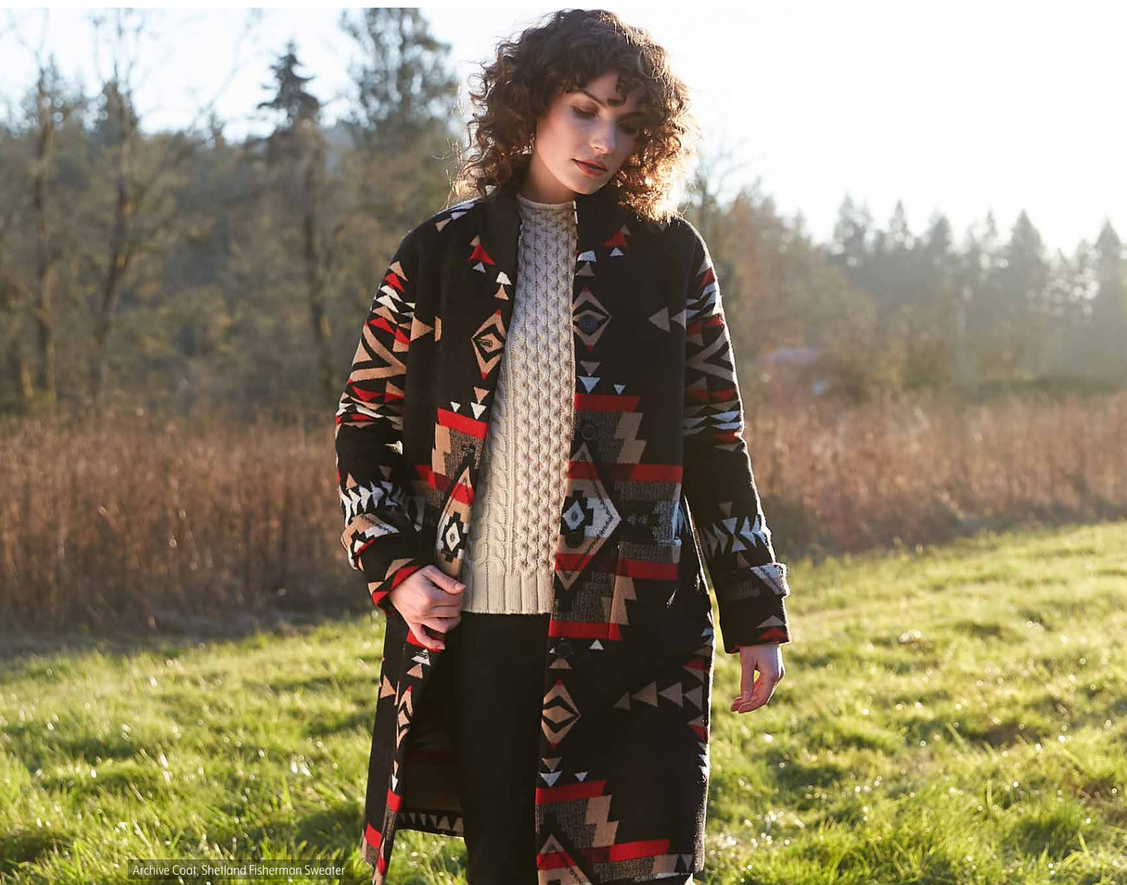
Archive Coat, Shetland Fisherman Sweater