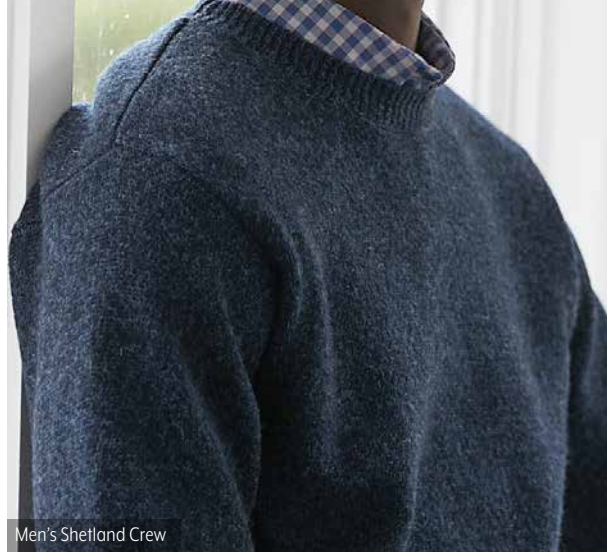
Men's Shetland Crew