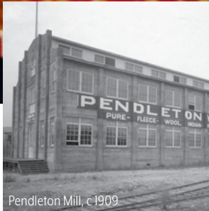
Pendleton Mill, c.1909