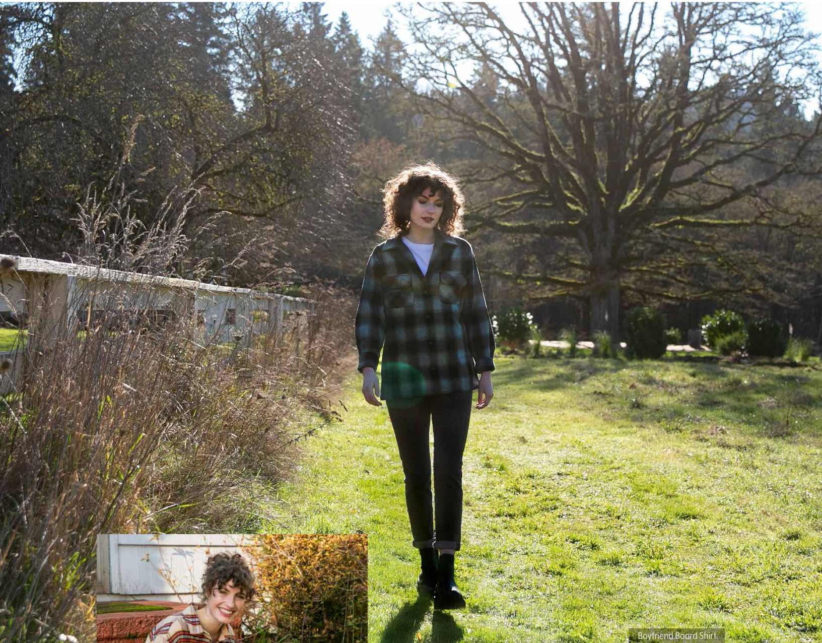
Boyfriend Board Shirt