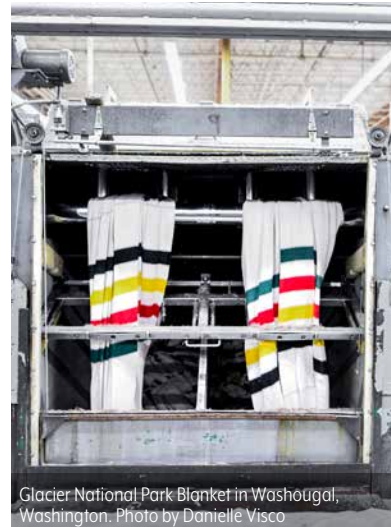
Glacier National Park Blanket in Washougal, Washington.

A Pendleton pattern makes a design statement, and it can also tell a story drawn from the legends, regions, and people of the Americas. That's why Pendleton outerwear pieces are literally worn for generations. With quality construction, timeless styles and stories, and durable wool, our coats and jackets are made to last.