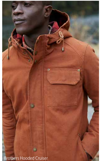
Brothers Hooded Cruiser