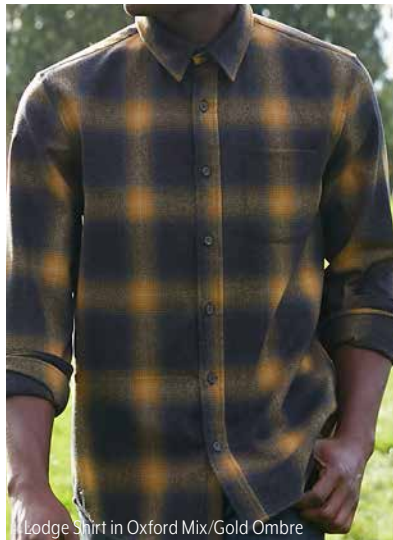
Lodge Shirt in Oxford Mix/Gold Ombre