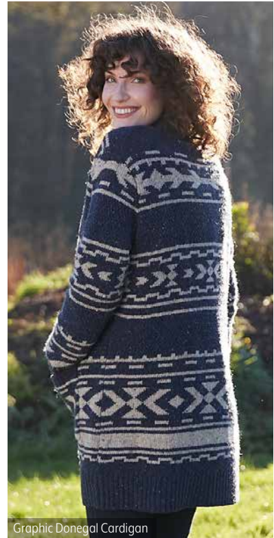
Graphic Donegal Cardigan