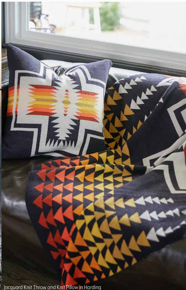
Jacquard Knit Throw and Knit Pillow in Harding