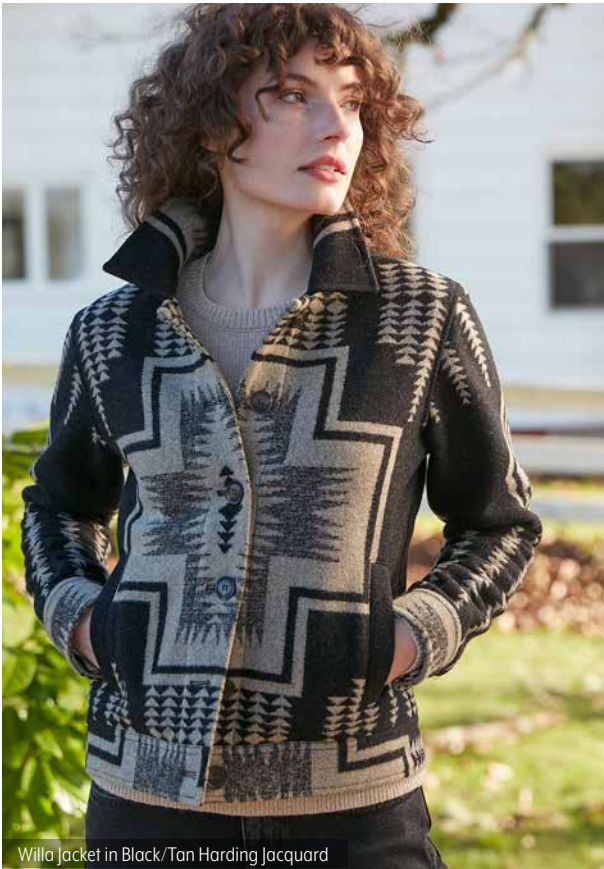
Willa Jacket in Black/Tan Harding Jacquard