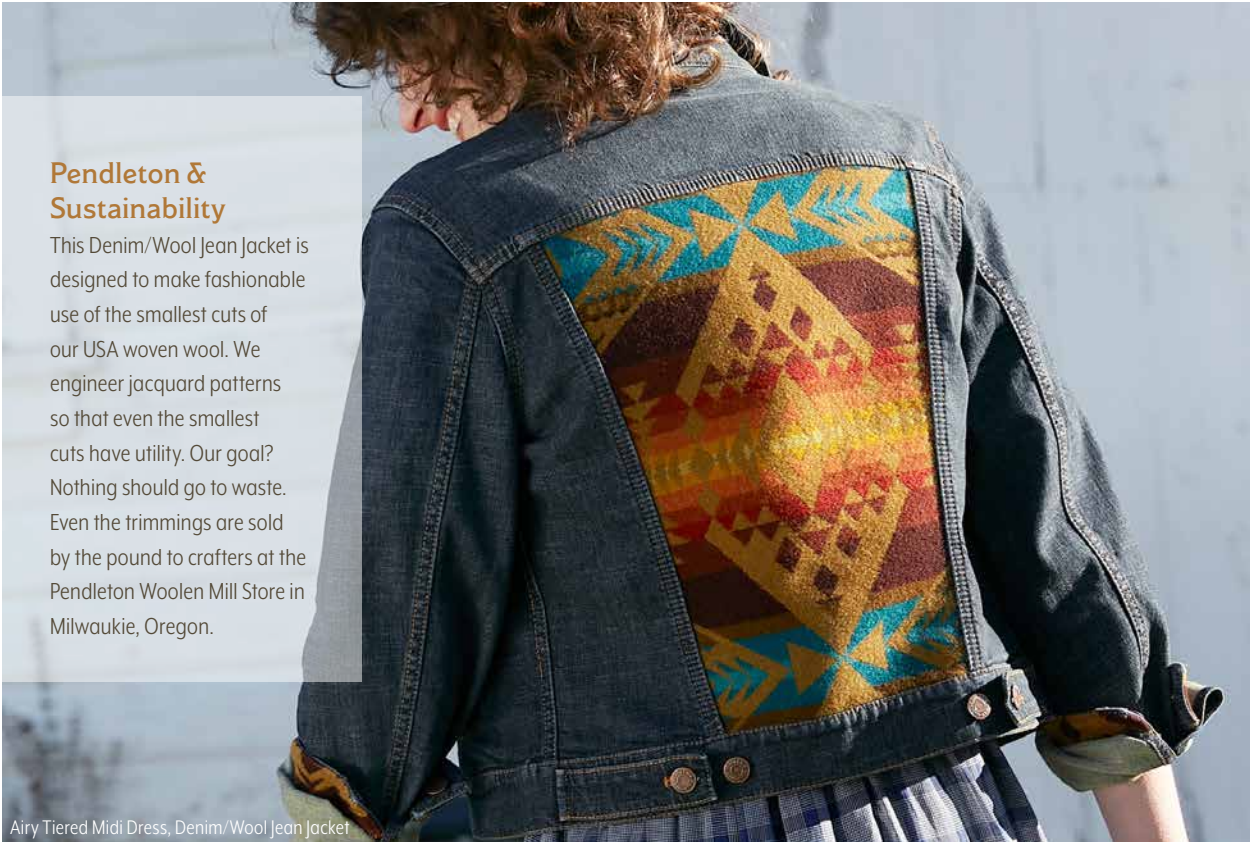
Airy Tiered Midi Dress, Denim/Wool Jean Jacket

This Denim/Wool Jean Jacket is designed to make fashionable use of the smallest cuts of our USA woven wool. We engineer jacquard patterns so that even the smallest cuts have utility. Our goal? Nothing should go to waste. Even the trimmings are sold by the pound to crafters at the Pendleton Woolen Mill Store in Milwaukie, Oregon.