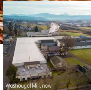
Washougal Mill, now