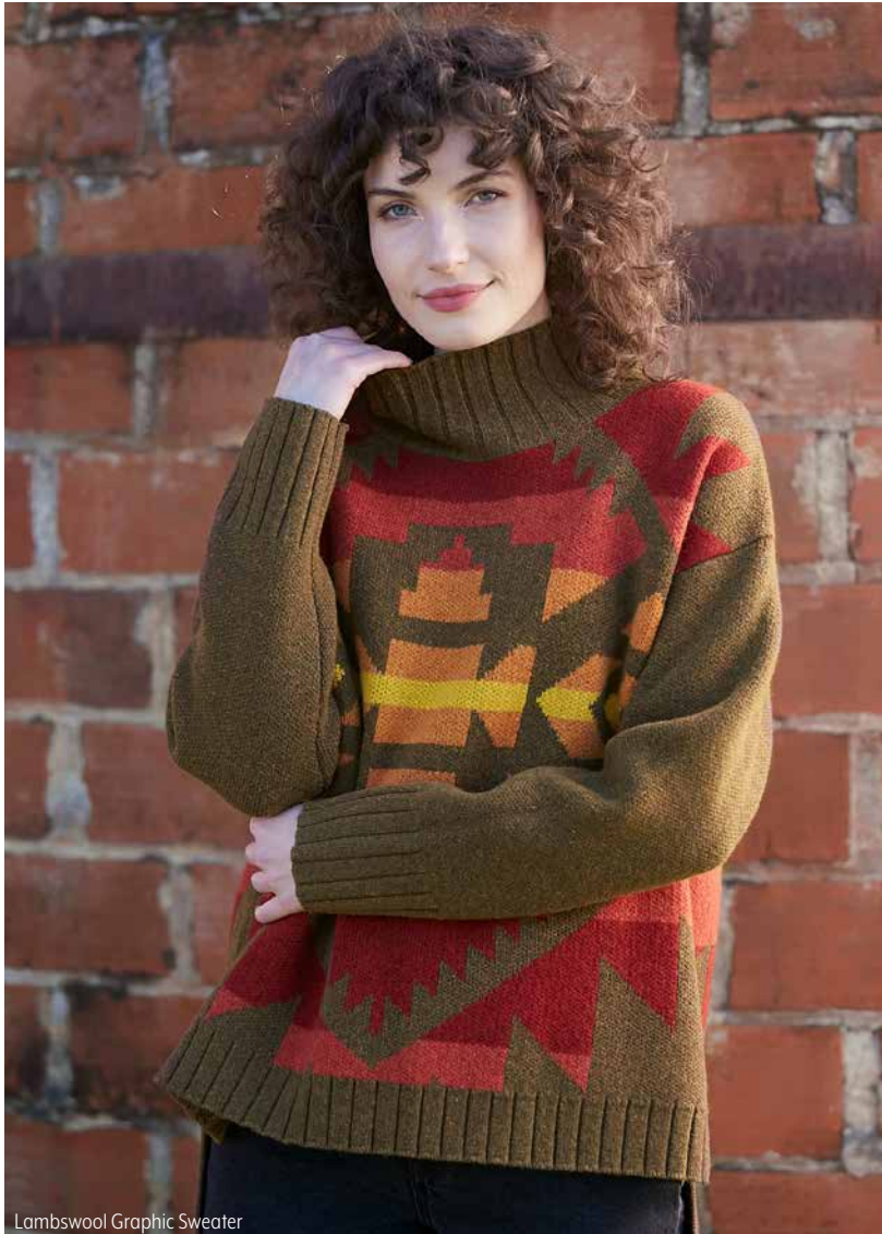
Lambswool Graphic Sweater