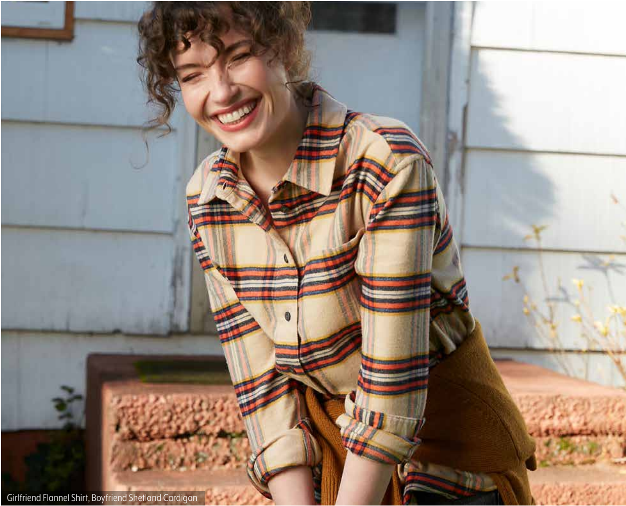
Girlfriend Flannel Shirt, Boyfriend Shetland Cardigan