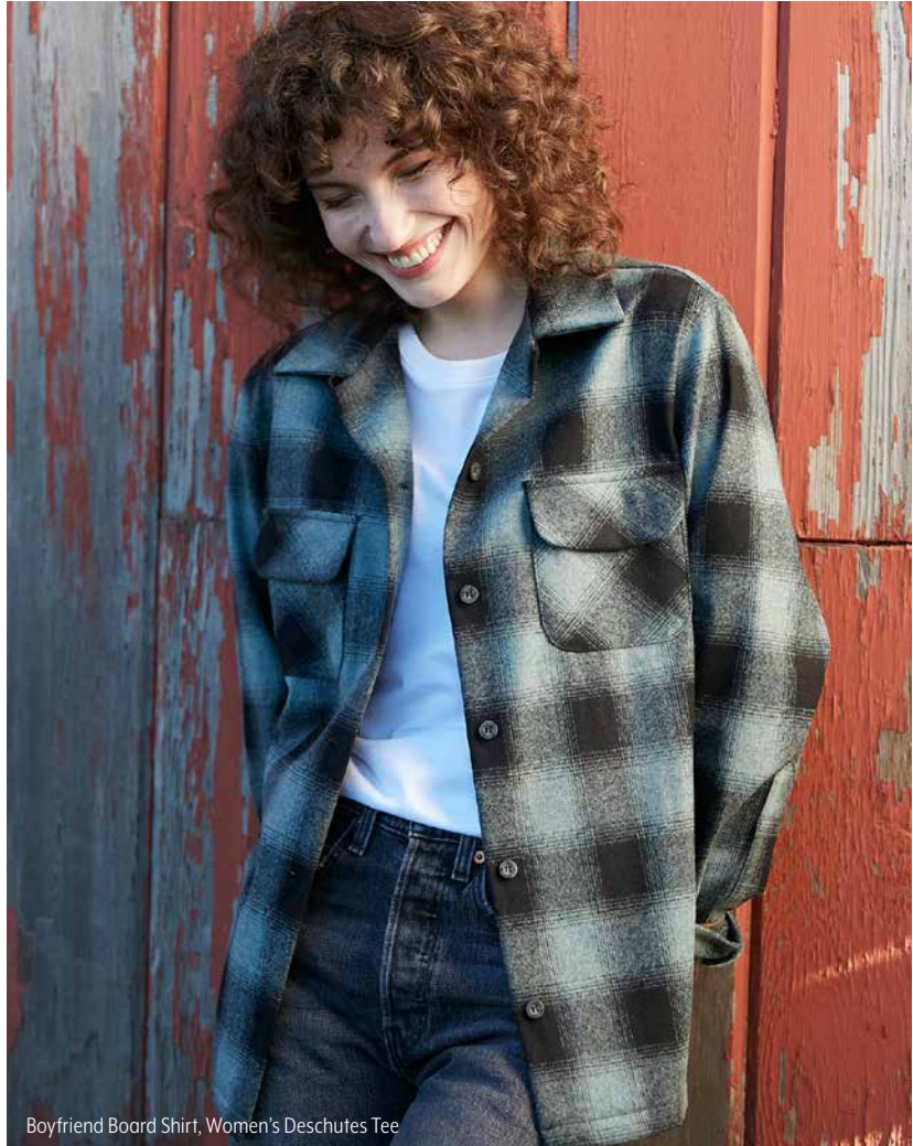
Boyfriend Board Shirt, Women's Deschutes Tee

Both the Women's Board and Lodge shirts are slightly modified for shape and fashion. This year, we're debuting the Boyfriend Board Shirt, which is a re-styling of the Men's Original Board Shirt that preserves all the popular design features: square hem, flap pockets cut on the bias, bias back yoke and open sport collar.