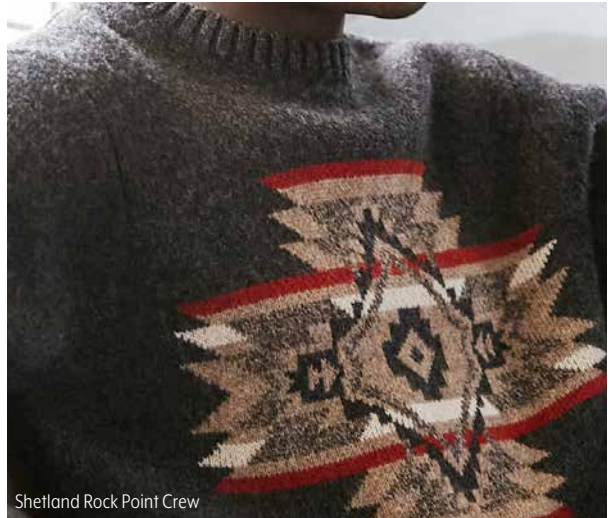
Shetland Rock Point Crew