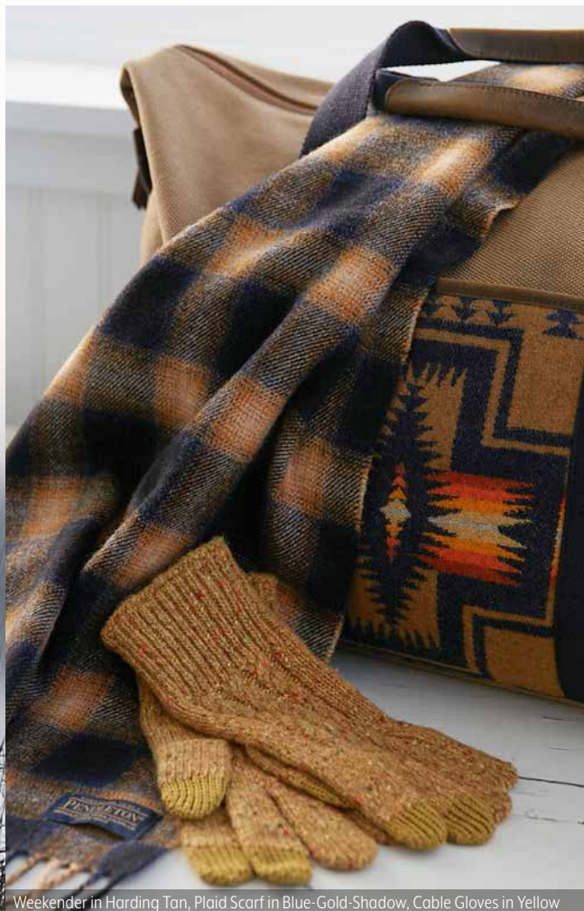
Weekender in Harding Tan, Plaid Scarf in Blue-Gold-Shadow, Cable Gloves in Yellow