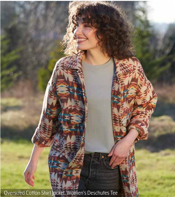
Oversized Cotton Shirt Jacket, Women's Deschutes Tee