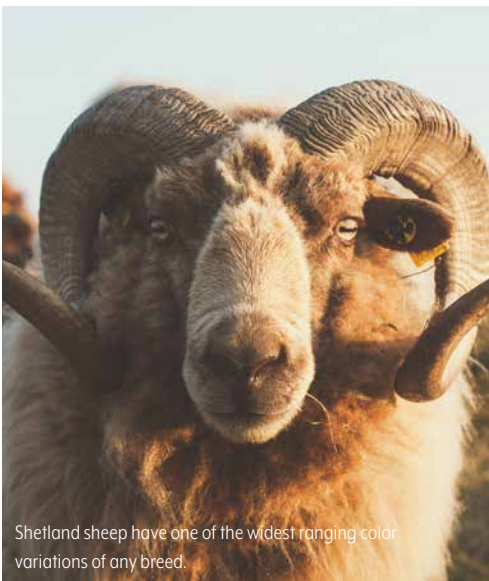
Shetland sheep have one of the widest ranging color variations of any breed.