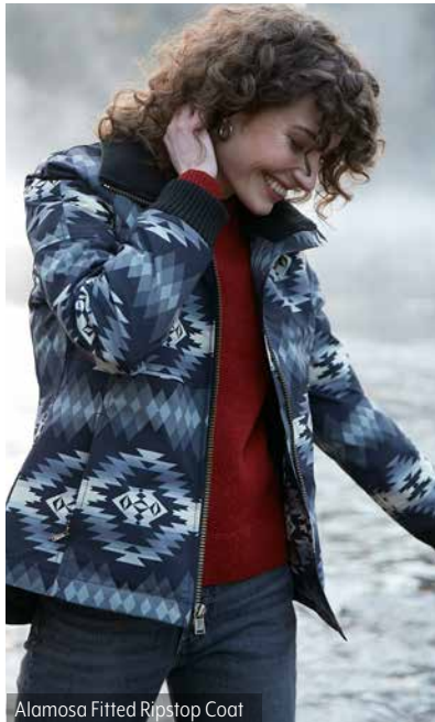
Alamosa Fitted Ripstop Coat