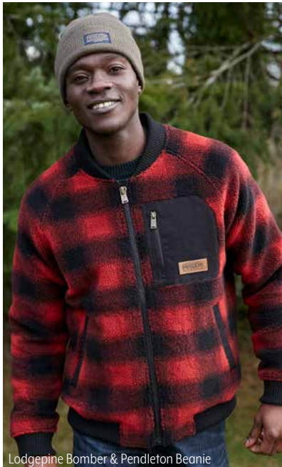
Lodgepine Bomber & Pendleton Beanie