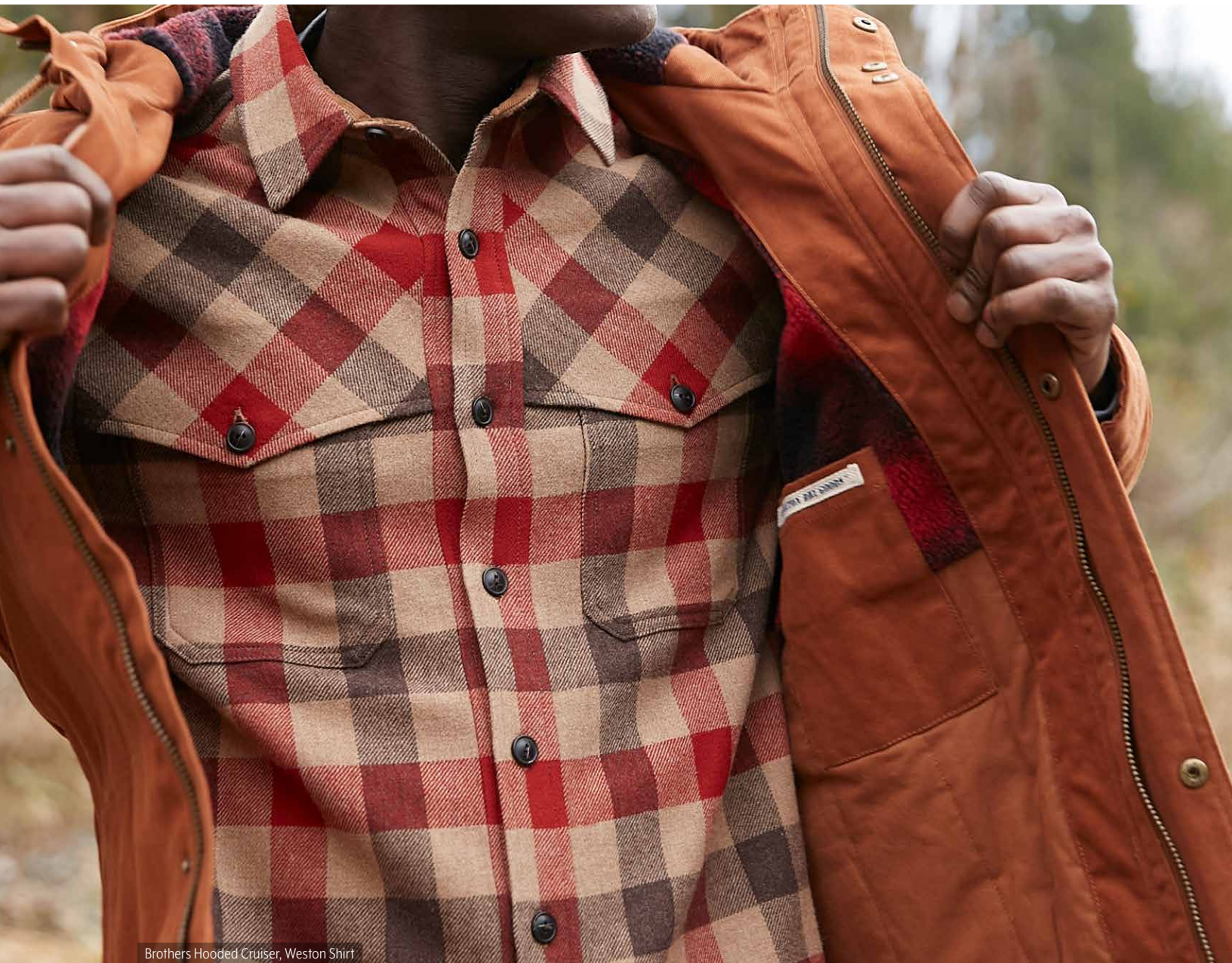
Brothers Hooded Cruiser, Weston Shirt