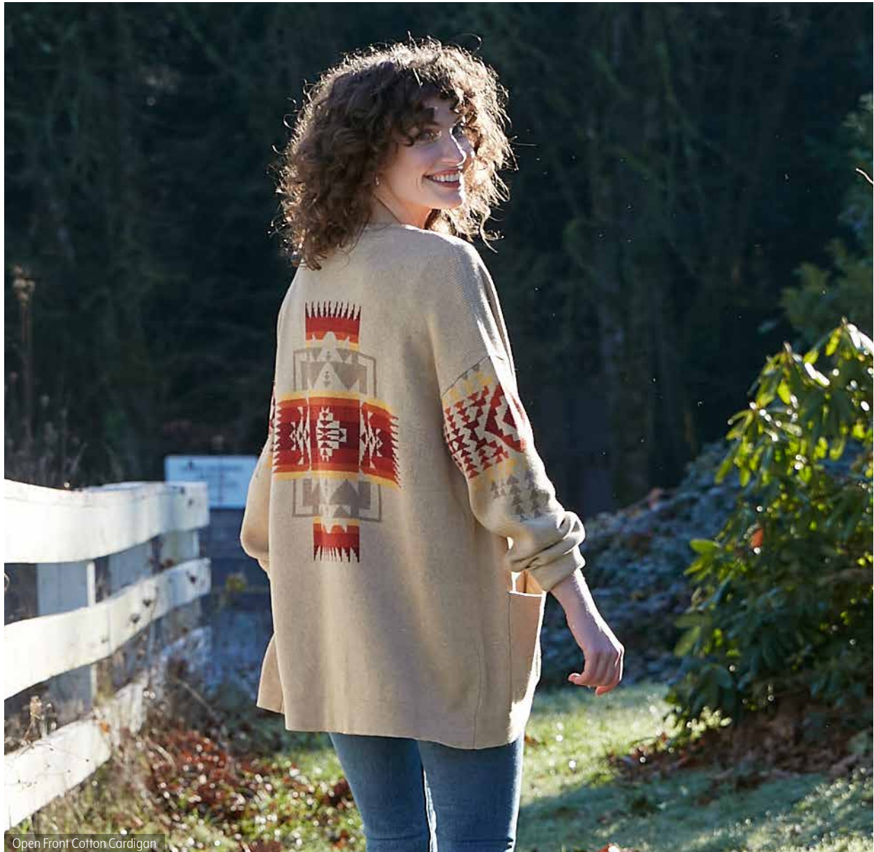
Open Front Cotton Cardigan

Double Brushed Cotton Flannel is a favorite in men's and women's shirts—in distinctly Pendleton plaids. Wear it over our Deschutes tees; color, comfort and style in a quality tee that lasts. Our cotton chamois is a substantial fabric, sheared on both sides for velvety comfort. Lined with a dense Sherpa to add warmth without bulk, it can take you into the great outdoors.