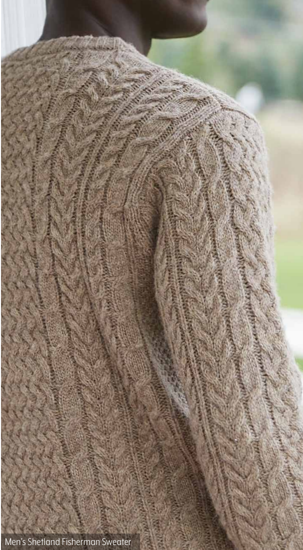
Men's Shetland Fisherman Sweater