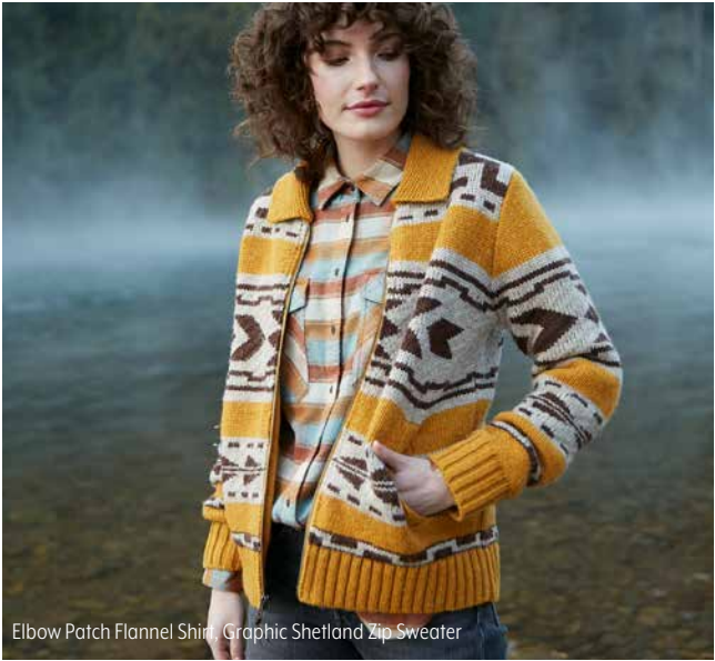
Elbow Patch Flannel Shirt, Graphic Shetland Zip Sweater