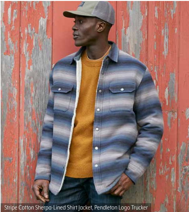
Stripe Cotton Sherpa-Lined Shirt Jacket, Pendleton Logo Trucker