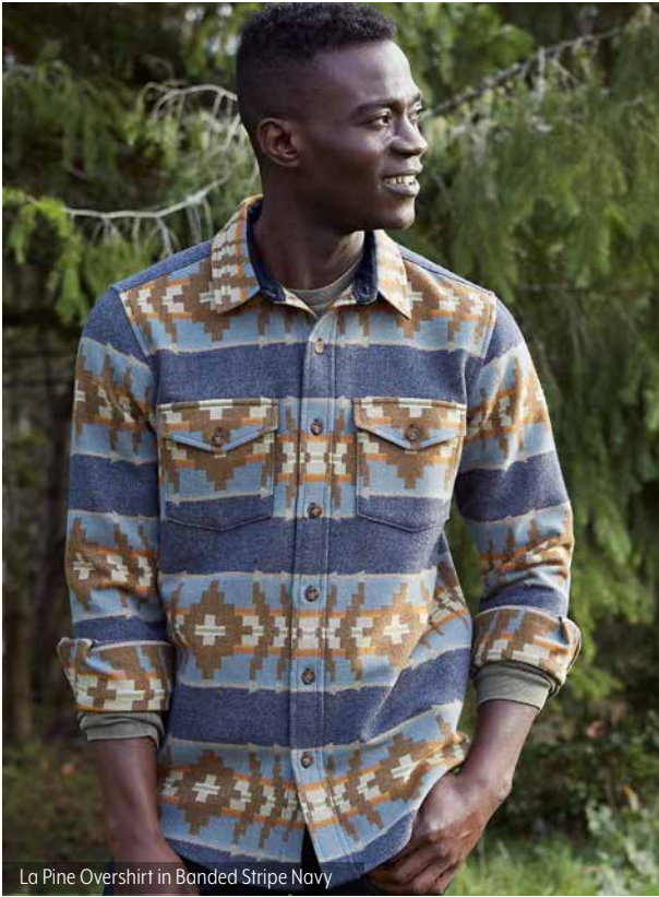
La Pine Overshirt in Banded Stripe Navy