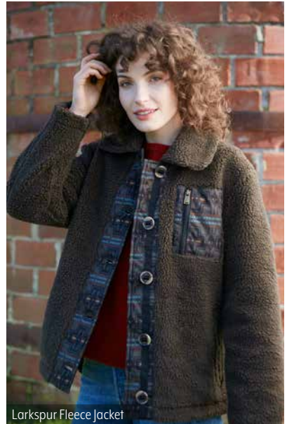
Larkspur Fleece Jacket