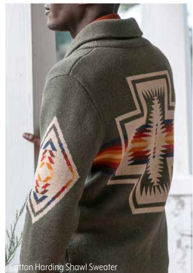
Cotton Harding Shawl Sweater

Varying weights, lengths, collars, sleeve styles—even the stitch patterns used—mean there's a sweater for any kind of weather. That's important in the Pacific Northwest. When the days get shorter, the evening temperatures drop, especially when the skies are clear. A wool sweater chases away the chill.