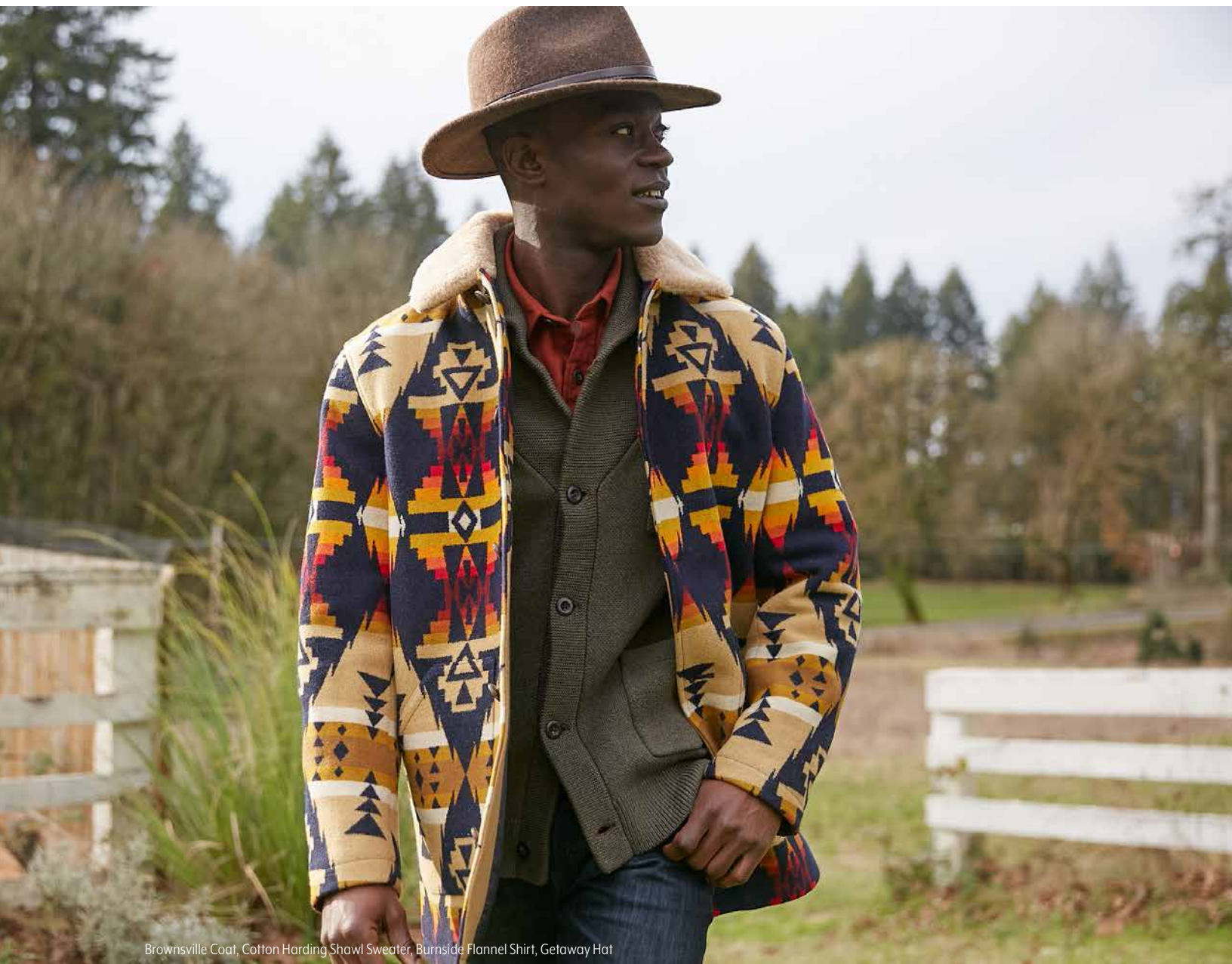
Brownsville Coat, Cotton Harding Shawl Sweater, Burnside Flannel Shirt, Getaway Hat