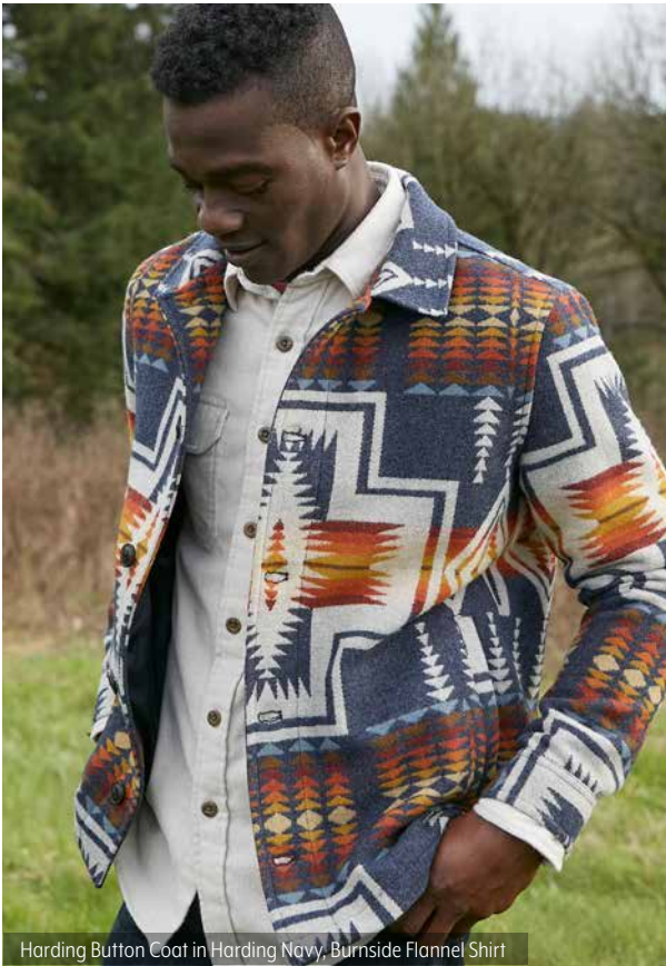
Harding Button Coat in Harding Navy, Burnside Flannel Shirt