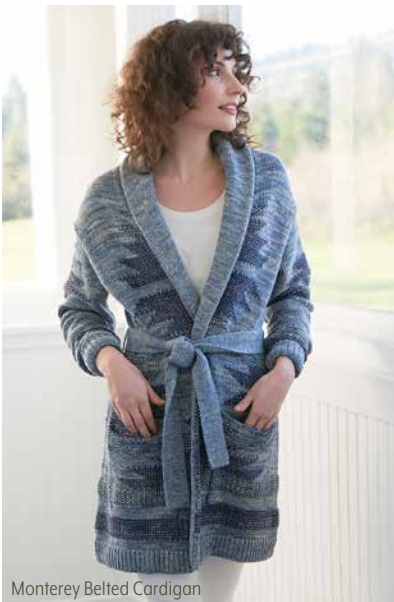
Monterey Belted Cardigan

when the sun warms the air and brings out the colors of changing leaves, Pendleton's new airy cotton pieces handle the transition beautifully.