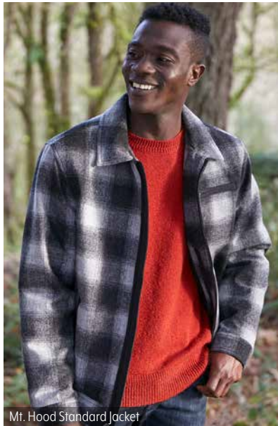
Mt. Hood Standard Jacket