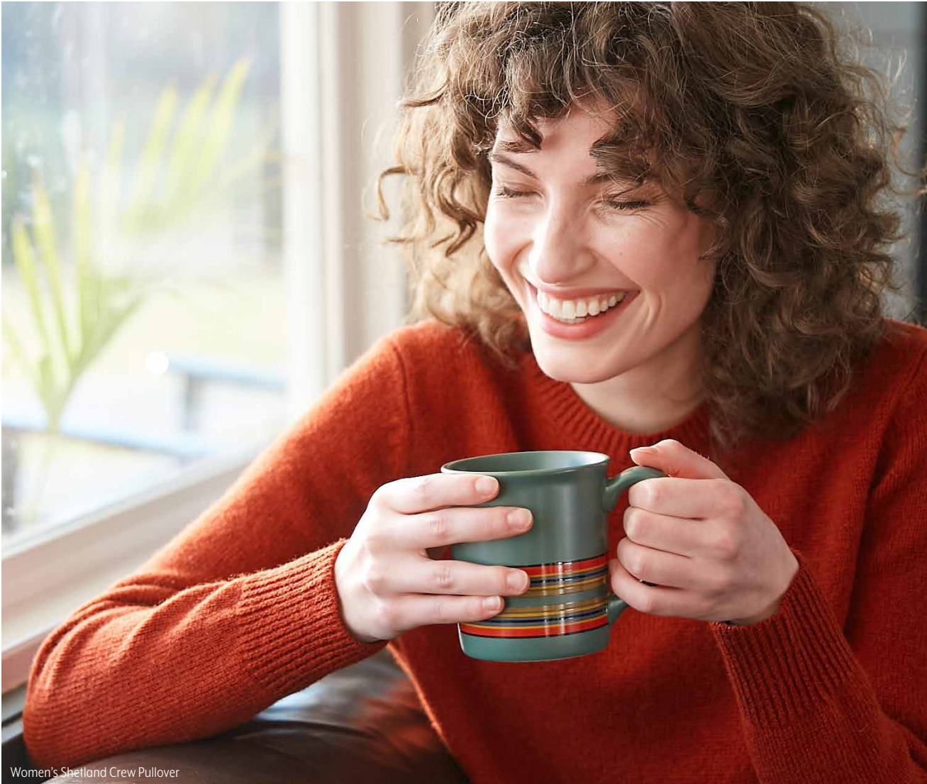
Women's Shetland Crew Pullover