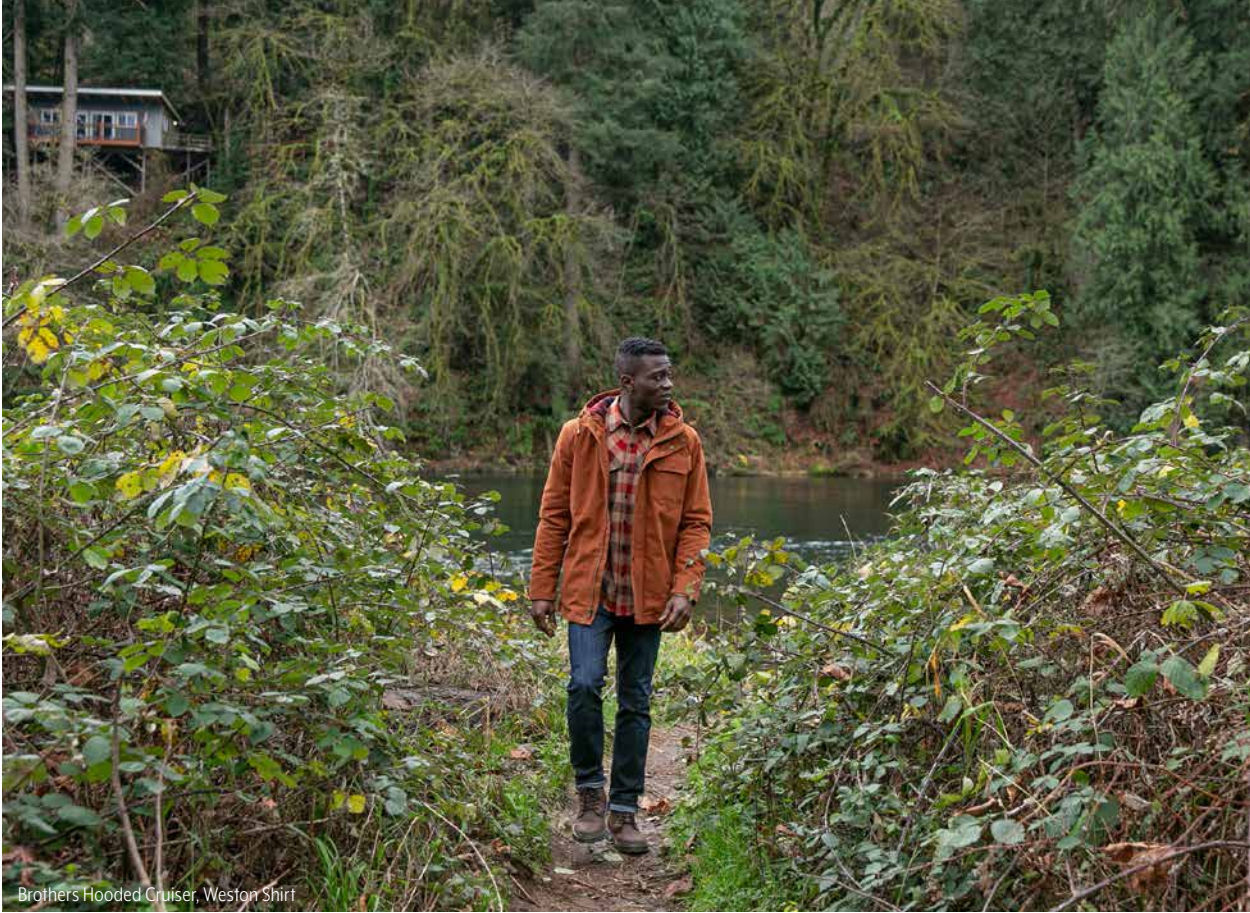
Brothers Hooded Cruiser, Weston Shirt