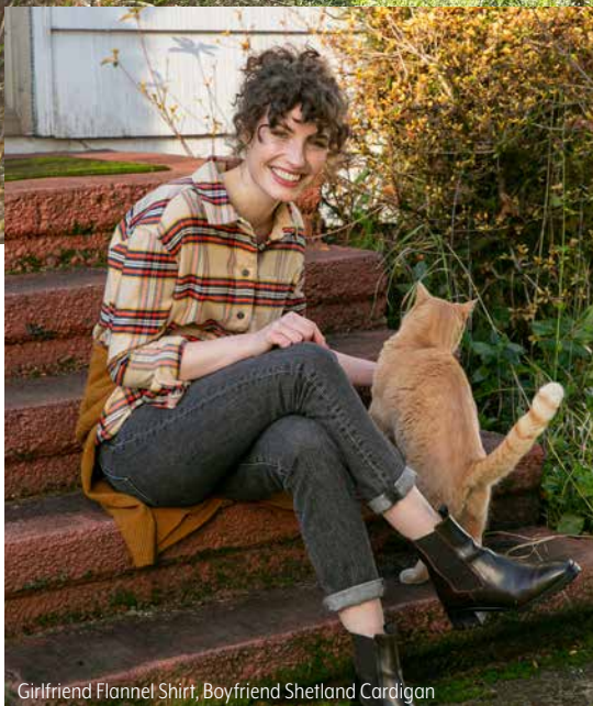
Girlfriend Flannel Shirt, Boyfriend Shetland Cardigan