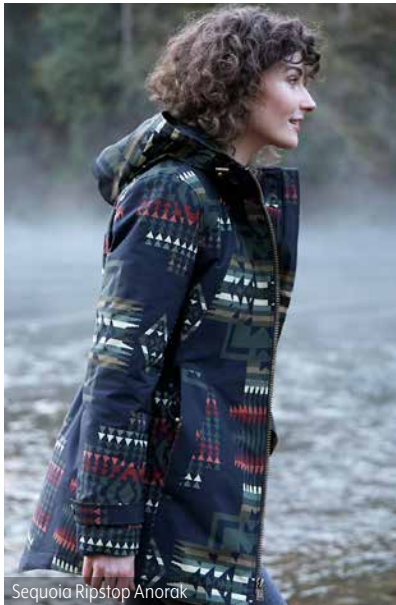
Sequoia Ripstop Anorak

The Northwest is a recreational wonderland. The forests and deserts are crisscrossed by hikers and mountain bikers throughout the year. In the summer, beautiful rivers attract rafters and boaters. In the winter? It's time for skiing and snowboarding in the mountains and walks in the rain everywhere else. This outdoor laboratory helps Pendleton design the perfect outerwear for any condition.