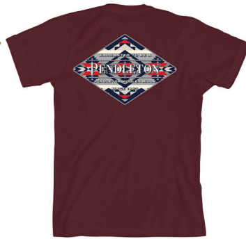
TECOPA HILLS DIAMOND