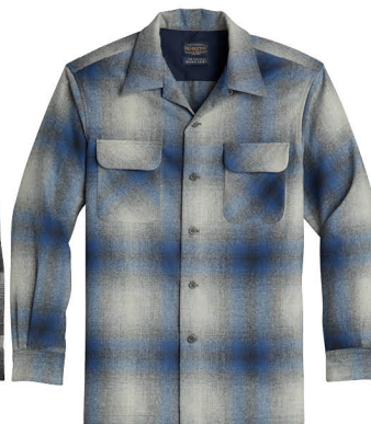
5/25 RA790-32509 AA800-32509 Tall Blue/Grey Mix Ombre