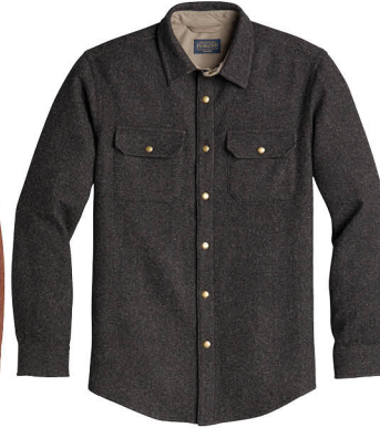
8/25 RA504-32543 Black/Taupe