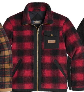
8/25 C2015-83010 Red Buffalo