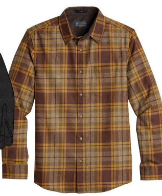
7/25 RA643-32492 Brown/Copper/Olive Plaid