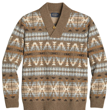
8/25 RF788-74192 Summit Peak - Tan