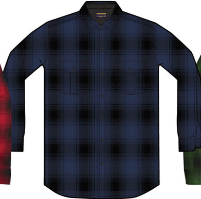
8/25 RA551-32349 Blue/Black