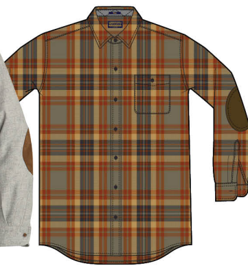
7/25 RA638-32503 Brown/Copper/Gold Plaid