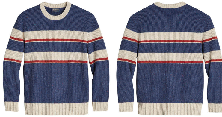
7/25 RF806-74184 Navy Park Stripe

RF806 S - 2XL $199.00 RF850 S - 2XL $199.00