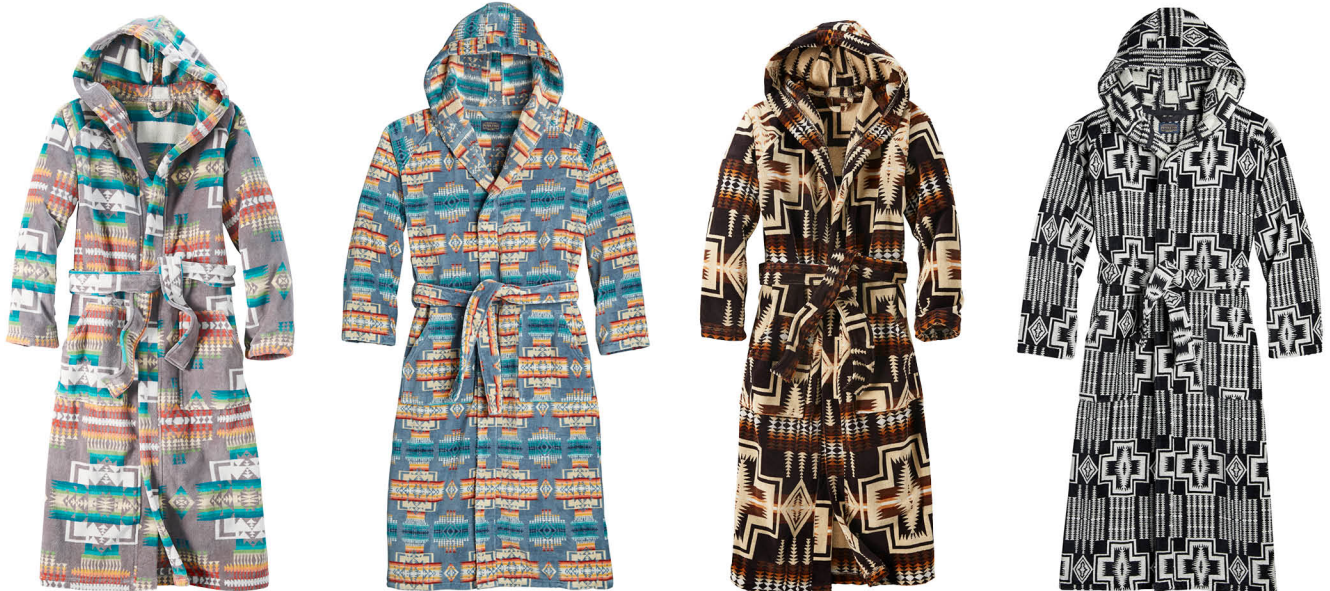
9/25 AP717-81868 Chief Joseph - Grey

Tested for harmful substances and produced sustainably in accordance with OEKO-TEX® guidelines. This purchase is made with materials tested for harmful substances, made in environmentally friendly facilities and made in safe and socially responsible workplaces. Learn more at madeingreen.com