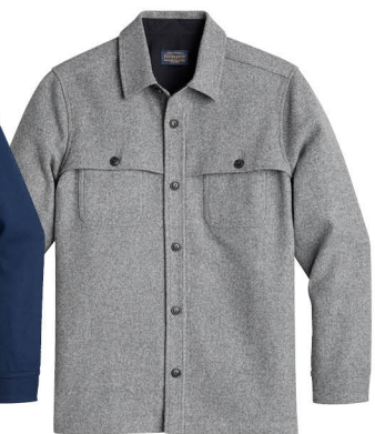
7/25 RK373-28261 Grey Mix