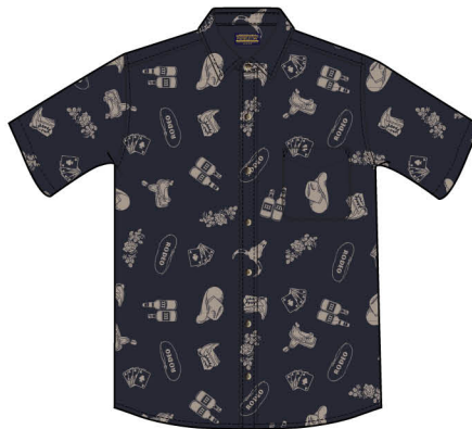
7/25 RA558-79319 Rodeo Navy