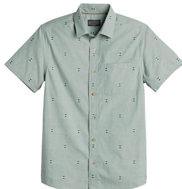
5/25 RA566-79258 Dark Forest Chambray Dobby