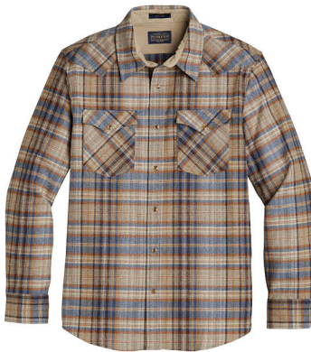
7/25 RA642-32486 AA848-32486 Tall Brown/Blue/Gold Multi