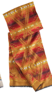
GR640-54249 Mission Trails