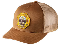
GMI02-54573 Dark Tan (Yellowstone)

60% Cotton, 40% Polyester, 5 panels, hard interfacing, curved brim, snap-back closure, available 3/25/22 $29.50