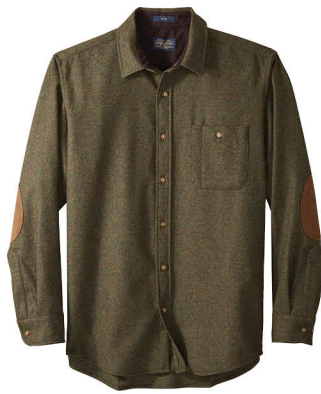
5/25 RA637-28172 Peat Moss Mix

RA638 S - 2XL $165.00 RA637 S - 2XL $165.00 RA838 S - 2XL $165.00 AA847 M - 2XL $175.00