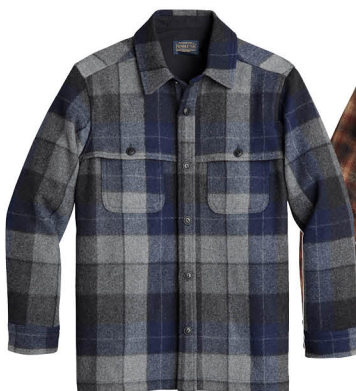
7/25 RK354-32521 Oxford/Navy Plaid

RK354 S - 2XL $319.00 RK373 S - 2XL $319.00