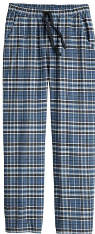
9/25 AP702-79277 Grey/Azure Plaid