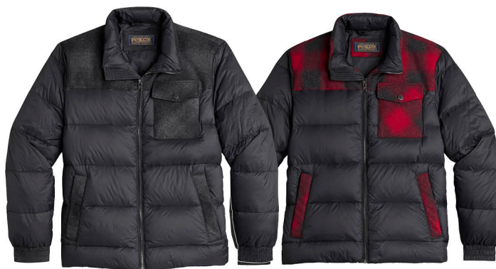
8/25 CM230-83217 Black/Charcoal Ombre