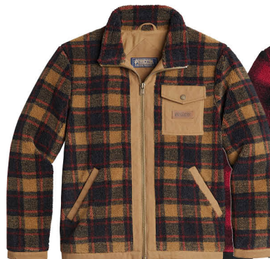
8/25 C2015-83206 Saddle Plaid