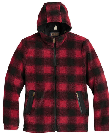
8/25 C2210-83010 Red Buffalo

C2210 S - 2XL $220.00 C2211 S - 2XL $220.00