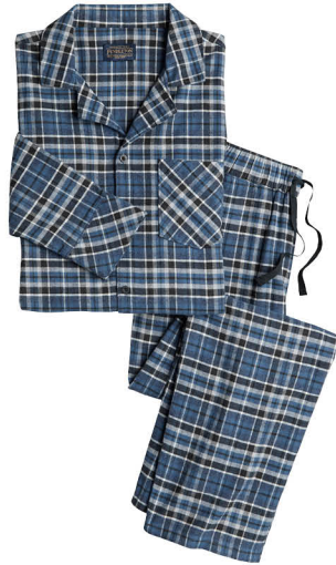
9/25 AP701-79277 Grey/Azure Plaid