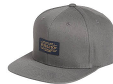
GMI40-54400 Dark Grey

6 panels, hard interfacing, flat brim, snap-back closure $29.50