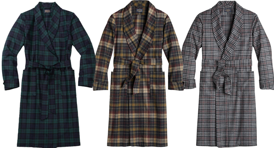
9/25 AD686-31869 Black Watch Tartan