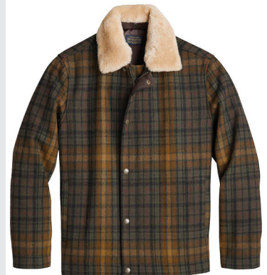
9/25 RK774-32522 Olive/Green Plaid