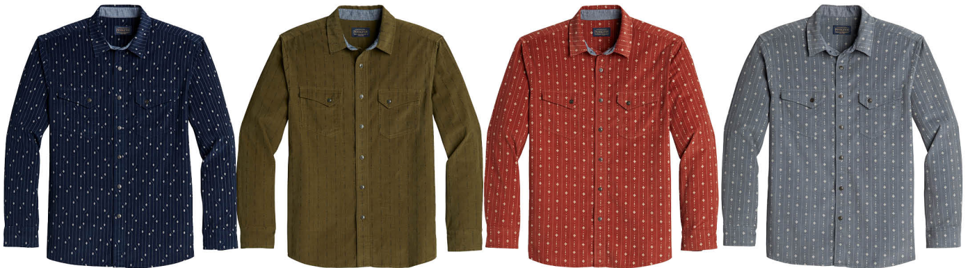
8/25 RA800-79296 Ocean Blue

Same styling as our best-selling Wyatt shirt in discharge-print cotton corduroy. Peaked front and back yoke details, distinctive peaked flap pockets, shirttail hem. Machine washable, 100% cotton, imported, hanging, 4.3 oz.