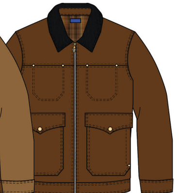
8/25 C2022-83024 Whiskey