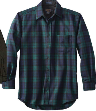
5/25 RA643-30069 Black Watch Tartan