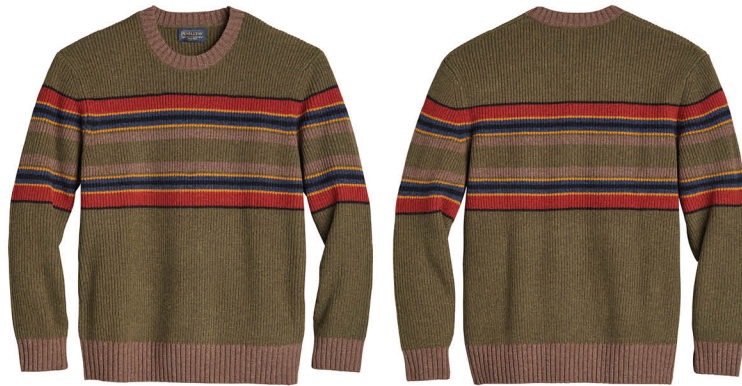
9/25 RF850-74189 Yakima Stripe - Green