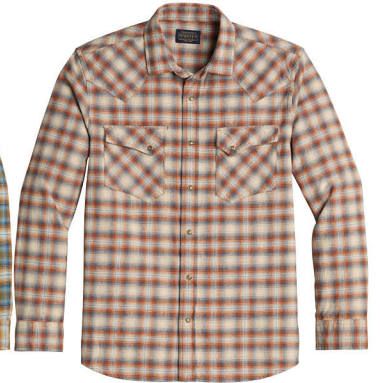
8/25 RA547-79300 Sky Blue/Sienna Plaid