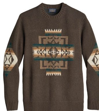
9/25 RF786-74188 Chief Joseph - Brown