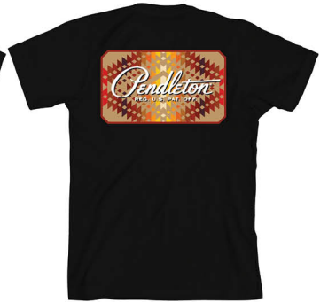
MISSION TRAILS LOGO