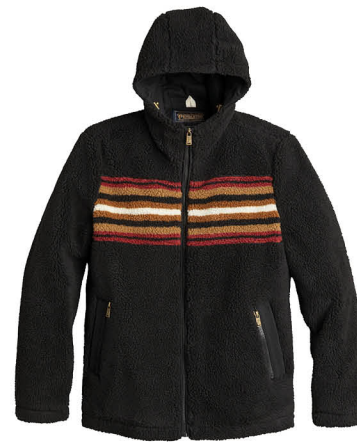
8/25 C2211-83205 Black/Red Stripe

GREENHORN JACKET Workwear bomber style in 12 oz. Big Sky Canvas, with poly fill for warmth. Zip front, toggle cord hood, contrast trims at forearms, hood, pockets, hem. Machine washable, shell 100% cotton, upper lining of 60% wool, 40% polyester, lower lining 100% cotton, sleeve lining 100% polyester, 100% polyester fill. Back length size M: 28"