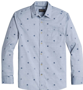
5/25 RA594-79314 Silver Blue