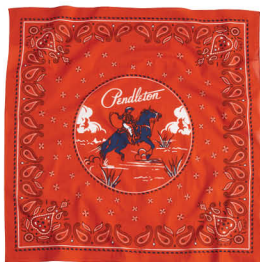
GZ970-54253 Cowboy Red

GZ970 Bandana 25" x 25", available 4/25/22 $19.50