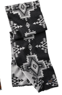
GR640-54796 Rock Point