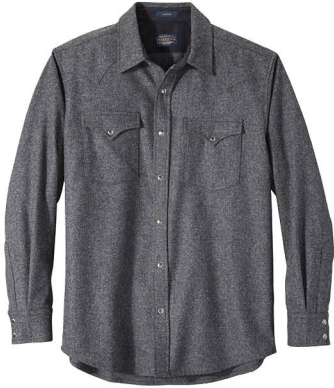
5/25 RA640-28347 AA853-28347 Tall Oxford Mix