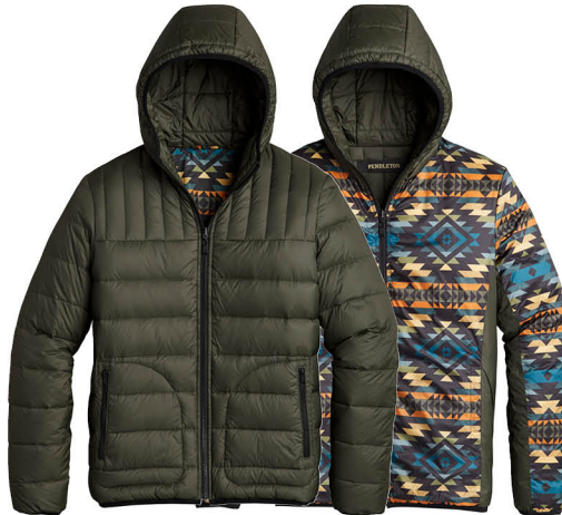
8/25 CM226-83223 Pueblo Dwelling Black