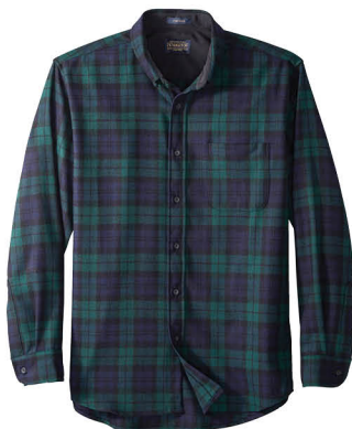
9/25 RA645-30069 Black Watch Tartan