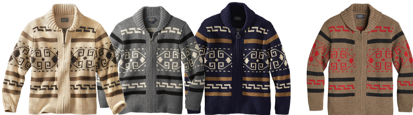
5/25 RF004-61161 Tan/Brown

A faithful recreation of the 1972 sweater worn by The Dude in "The Big Lebowski." Zip front, metal ring zipper pull, ribbed shawl collar. Dry clean, 100% lambswool, imported.