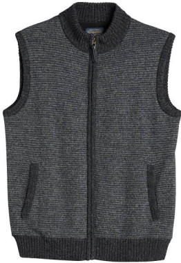
9/25 RF773-74171 Charcoal/Black