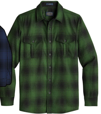
8/25 RA551-32511 Green/Black