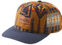
GMI37-54785 Harding Tan

Body is 100% Virgin Wool, visor is 100% Cotton, leather trim, 6 panels, medium interfacing, curved brim, snap-back closure, available 7/25/22 $39.50