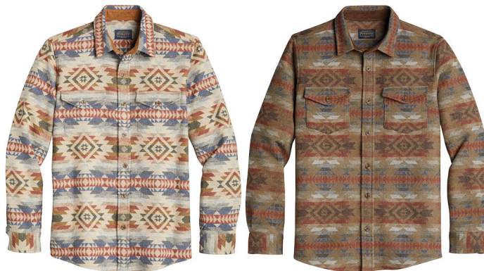
7/25 RA468-16076 Smith Rock - Tan