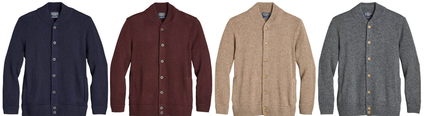
7/25 RF489-74178 Navy