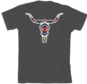
TECOPA HILLS LONGHORN

7/25 RG895-74231 Heavy Metal 100% cotton