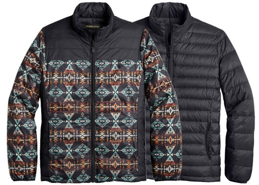
8/25 CM227-83221 Diamond Peak Black/Blue