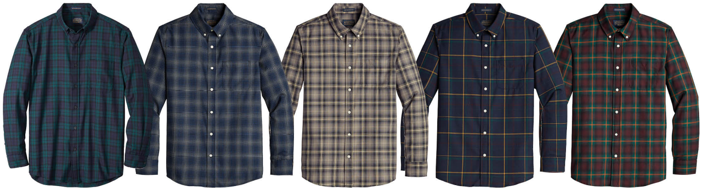
9/25 RA647-10052 Black Watch Tartan