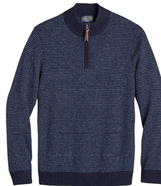
9/25 RF772-74173 Navy/Indigo