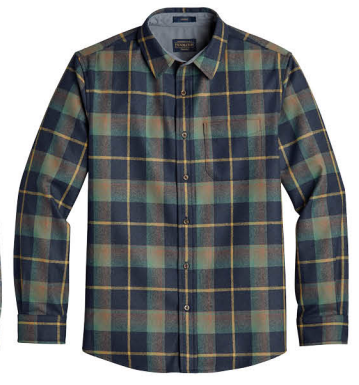
5/25 RA643-32504 Aqua/Slate Ombre