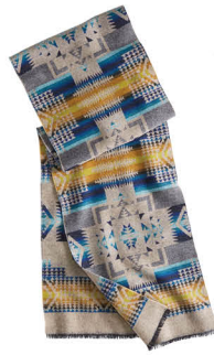
GR640-54250 Chief Joseph Blue

GR640 Jacquard Scarf fringe 0.5" 76" x 12" $94.50