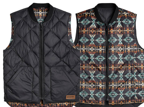
8/25 CM028-83221 Diamond Peak Black/Blue