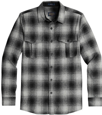
8/25 RA551-32346 Natural/Black