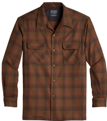
7/25 RA790-32496 Brown Ombre