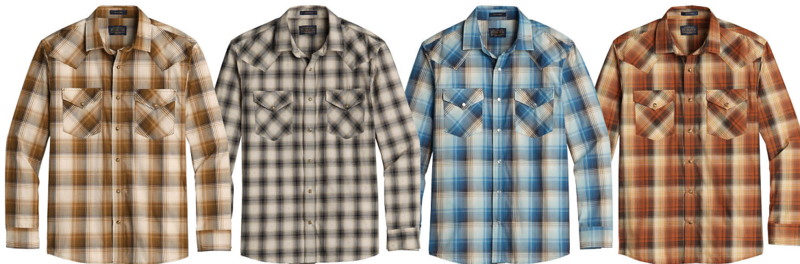
5/25 RA568-79276 Brown/Gold/Fir Plaid