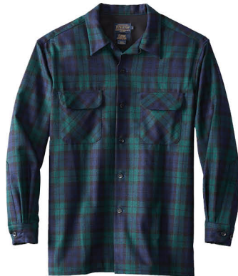
5/25 AA022-30069 Black Watch Tartan