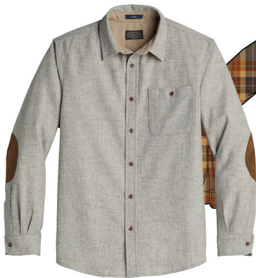
7/25 RA838-32502 Dark Natural