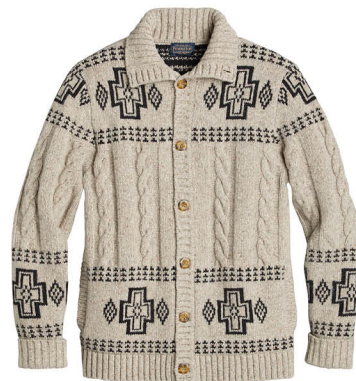
7/25 RF797-74175 Natural Donegal