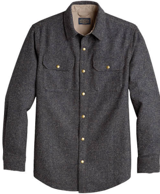
8/25 RA504-32541 Navy/Taupe