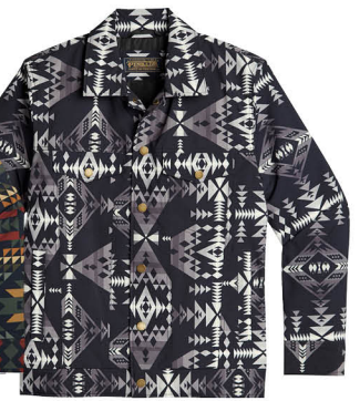
8/25 CM229-83224 Diamond Peak Black/Grey