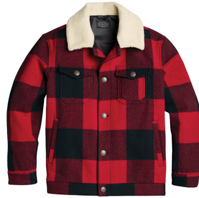
8/25 RK784-32158 Red/Black Buffalo Check