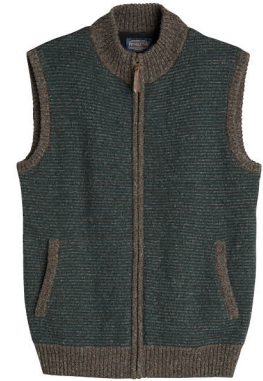
9/25 RF773-74174 Brown Mix/Deep Green

SHETLAND 1/4 ZIP SWEATER Mock neck, leather zipper pull. Machine washable, 100% Shetland wool, imported.