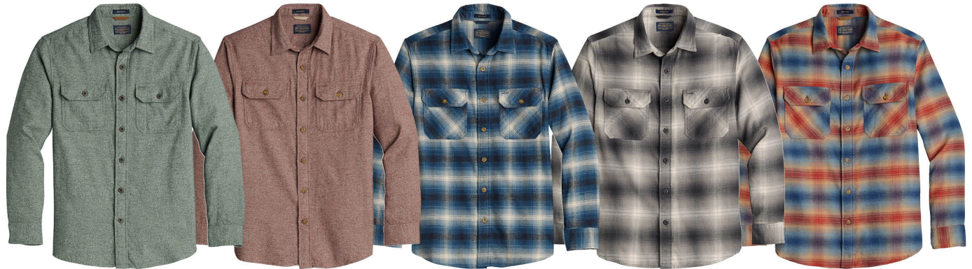
7/25 RA661-79303 Cedar Heather