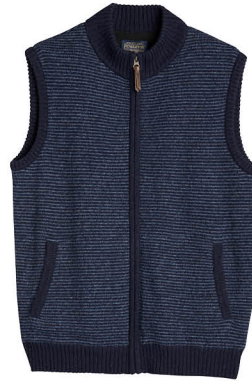
9/25 RF773-74173 Navy/Indigo