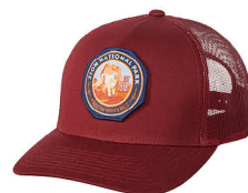
GMI02-54703 Maroon (Zion)