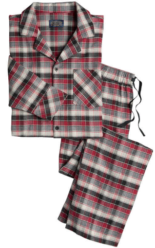
9/25 AP701-79279 Smoke Grey/Red Plaid