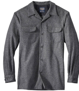
5/25 RA335-28347 AA826-28347 Tall Oxford Mix