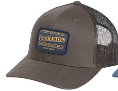
GMI41-54401 Dark Grey