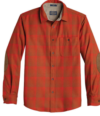
5/25 RA638-32494 AA847-32494 Tall Red/Copper Ombre