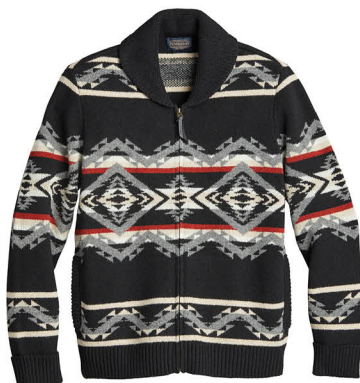
9/25 RF787-74185 Tecopa Hills - Black