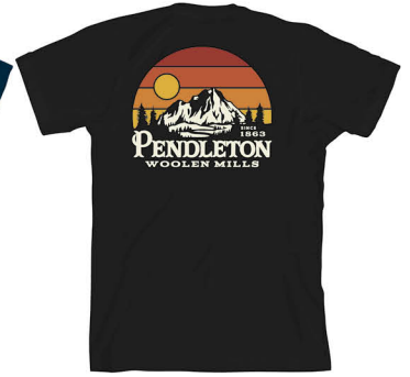
MOUNTAIN VIEW LOGO

7/25 RG887-74218 Midnight Navy 100% cotton