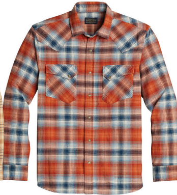
8/25 RA547-79298 Barn Red/Denim Plaid