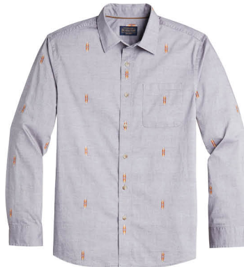
5/25 RA594-79315 Brown