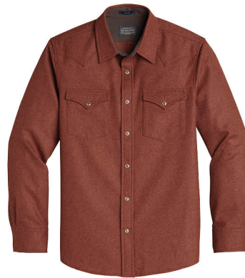
7/25 RA640-32520 Red Mix