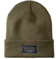
GS787-54829 Army Green