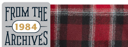
32499 Red/Black/Grey Plaid