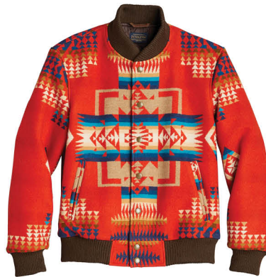
7/25 RK776-16071 Chief Joseph - Red