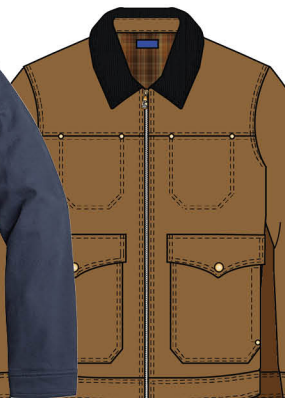
8/25 C2022-83208 Saddle