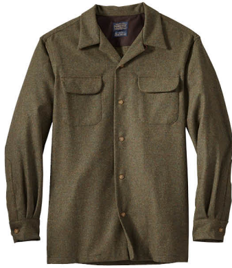
7/25 RA335-28172 AA826-28172 Tall Peat Moss Mix