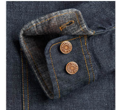
Wool Trim at Cuff

HESTON COAT Shell of virgin wool woven in our USA mills, double layer yoke with button-through pockets, button closures, side seam pockets. Dry clean, 100% virgin wool, imported of USA fabric, 24.0 oz. Back length on size M: 30"