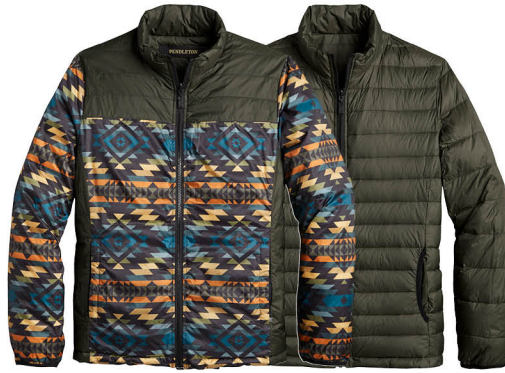
8/25 CM227-83223 Pueblo Dwelling Black