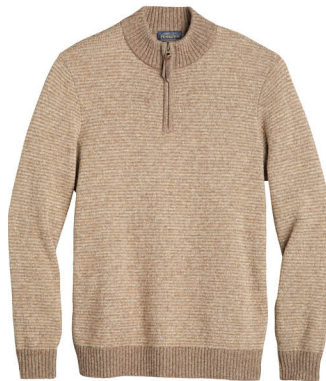
9/25 RF772-74172 Coyote/Tan