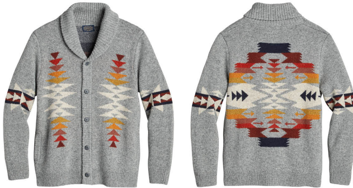
8/25 RF798-74193 Tucson - Grey