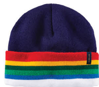
GS803-54814 Crater Lake available 11/25/21