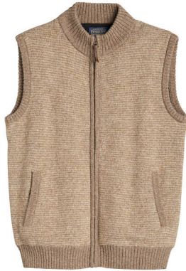
9/25 RF773-74172 Coyote/Tan