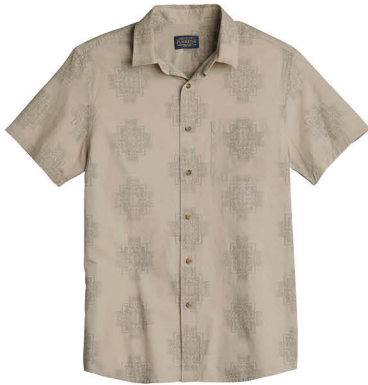
5/25 RA849-79306 Chief Joseph - Sand

Novelty print in ultra-light cotton with short sleeves, open pocket, shirrtail hem. Machine washable, 100% cotton, imported, hanging, 2.8 oz.