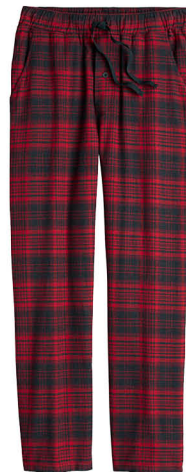
9/25 AP702-79278 Red/Fir Plaid