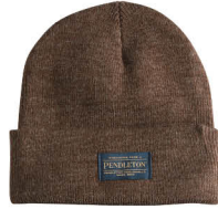
GS787-54917 Dark Brown Heather