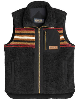
8/25 C2124-83205 Black/Red Stripe