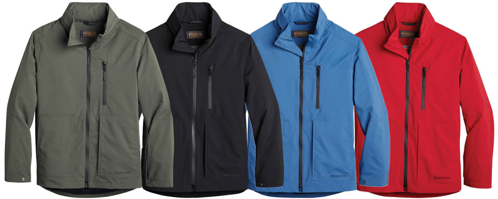
8/25 CM167-83229 Moss