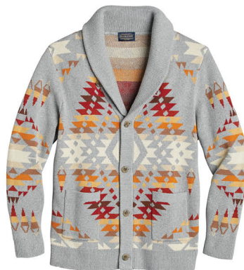
8/25 RF796-74190 Mission Trails - Grey