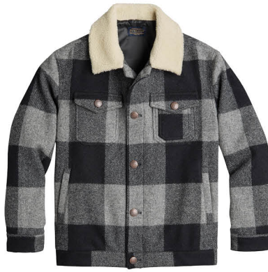
8/25 RK784-32184 Grey/Black Buffalo Check