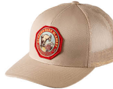
GMI02-54592 Natural (Glacier)