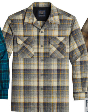
9/25 RA790-32479 Ivory Mix/Slate Ombre