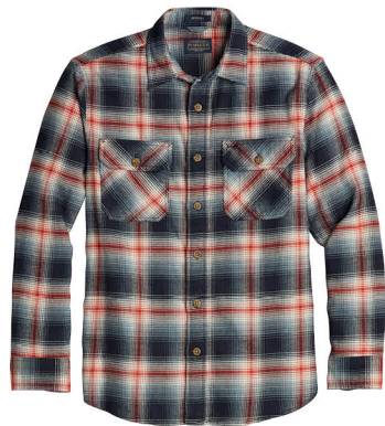
7/25 RA660-79290 Navy/Ivory/Red Plaid