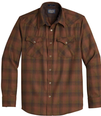
7/25 RA642-32496 Brown Ombre