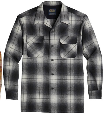
7/25 RA790-32501 AA800-32501 Tall White/Black Ombre