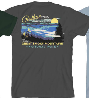
GREAT SMOKY MOUNTAINS