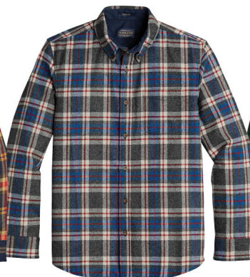
9/25 RA645-32488 Oxford Mix Windowpane