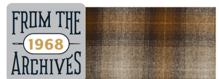
32500 Brown/Tan Ombre