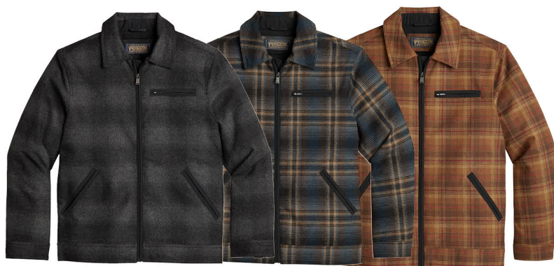
8/25 CM064-83217 Black/Charcoal Ombre