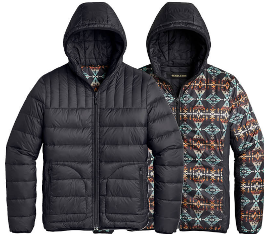
8/25 CM226-83221 Diamond Peak Black/Blue