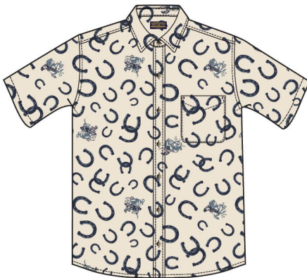
7/25 RA558-79320 Horseshoe Warm White

Novelty prints in ultra-light cotton with short sleeves, open pocket, shirrtail hem. Machine washable, 100% cotton, imported, hanging, 2.8 oz.