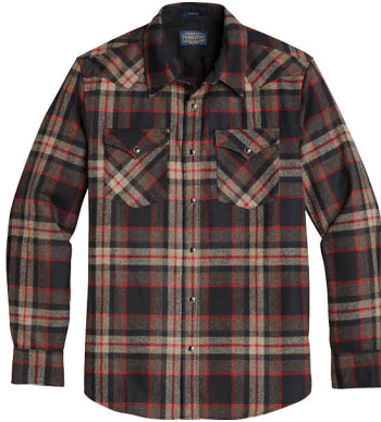
5/25 RA642-32489 Brown Mix Block Plaid