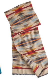
GR640-54251 Wyeth Trail