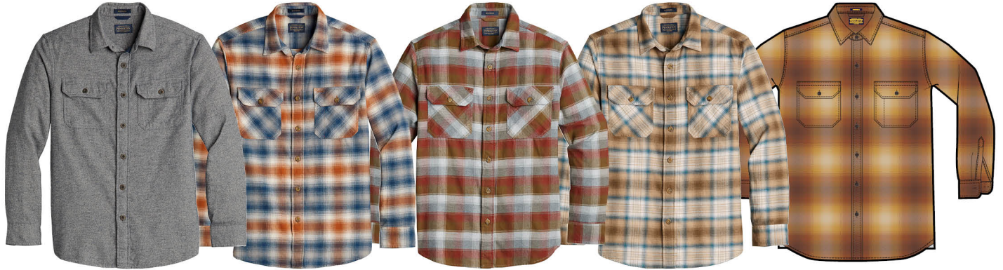
5/25 RA661-79301 Classic Navy Heather