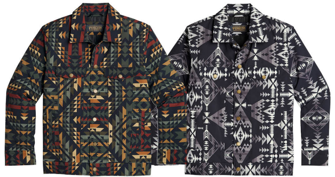
8/25 CM229-83225 Smith Rock Black