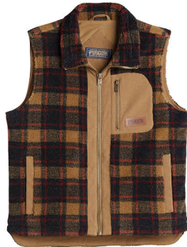
8/25 C2123-83206 Saddle Plaid