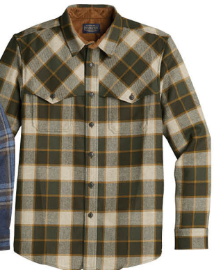
8/25 RA634-32518 Olive Mix Plaid