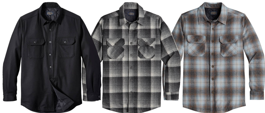
5/25 RK503-20042 Black

RK503 S - 2XL $249.00 RK448 S - 2XL $249.00 RK822 M - 3XL $299.00