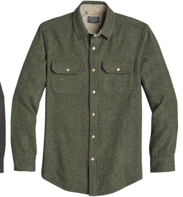
8/25 RA504-32542 Green/Taupe