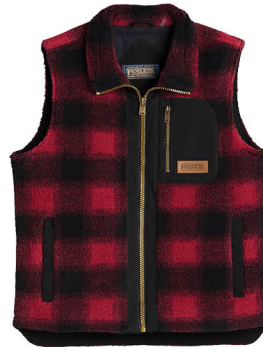
8/25 C2123-83010 Red Buffalo