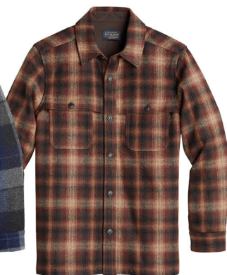
7/25 RK354-32519 Brown/Rust Ombre