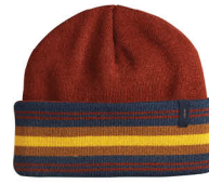
GS803-54499 Zion available 11/25/21