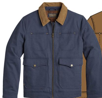
8/25 C2022-83209 Indigo