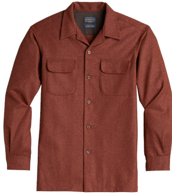
7/25 RA335-32520 Red Mix