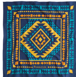
GZ970-54254 Smith Rock