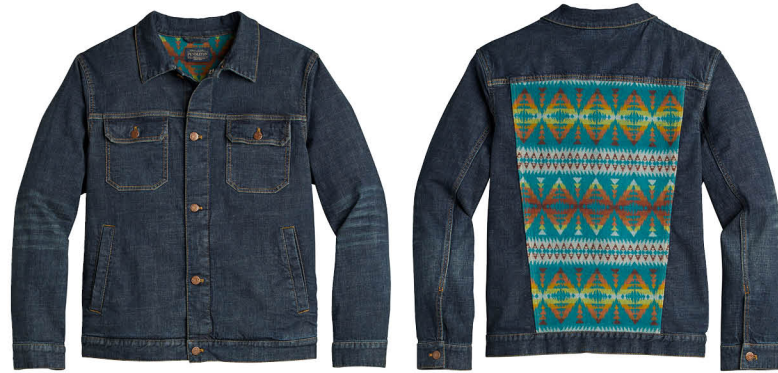
7/25 RK824-81876 Denim Blue/Summit Peak