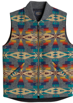
5/25 RK794-16070 Tucson - Grey Mix