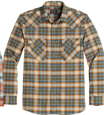
8/25 RA547-79241 Honey Ginger/Blue Plaid