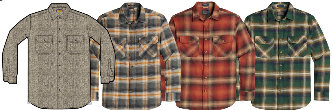
8/25 RA661-79305 Tan Heather