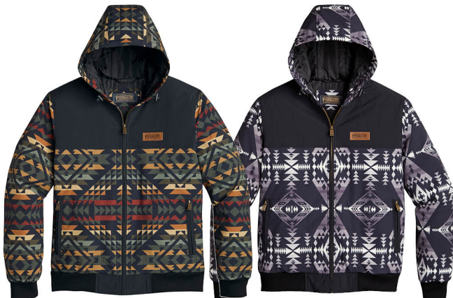
8/25 CM228-83225 Smith Rock Black