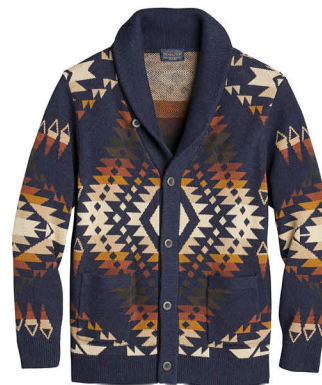
8/25 RF796-74191 Mission Trails - Navy