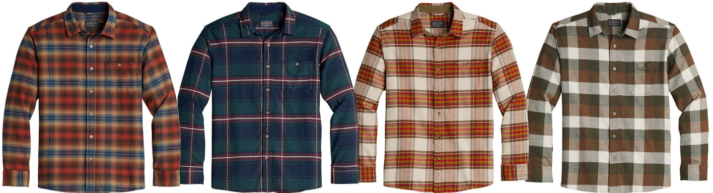
9/25 RA596-79280 Copper/Navy Plaid

Made in the same super-soft brushed cotton flannel as the Burnside, with a single drop-in button-through chest pocket and bias crossed-back yoke detail. Trimmed with fine wale corduroy on collar, cuffs, and side vent. Machine washable, 100% cotton, imported, hanging, 4.6 oz.