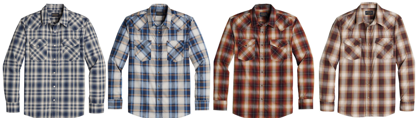
5/25 RA781-79308 Navy Ombre Plaid