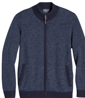
9/25 RF771-74173 Navy/Indigo