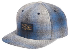
GMI39-32509 Blue/Grey Mix Ombre available 5/25/22

Body and top visor are 100% Virgin Wool, visor bottom is 100% Cotton, 6 panels, hard interfacing, flat brim, snap-back closure $34.50