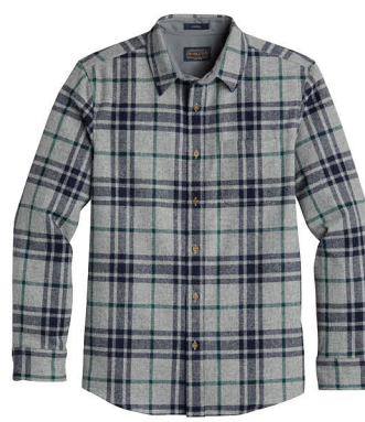
7/25 RA643-32482 Grey Mix/Navy/Green Windowpane