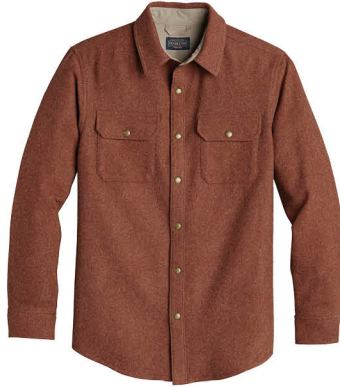
8/25 RA504-32540 Rust/Taupe