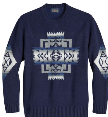
8/25 RF786-74187 Chief Joseph - Blue