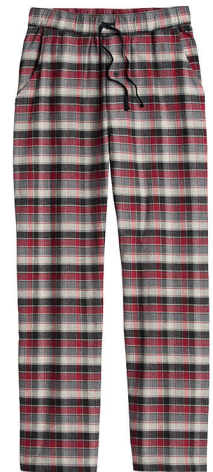
9/25 AP702-79279 Smoke Grey/Red Plaid