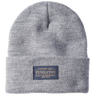
GS787-54890 Lt Grey Heather