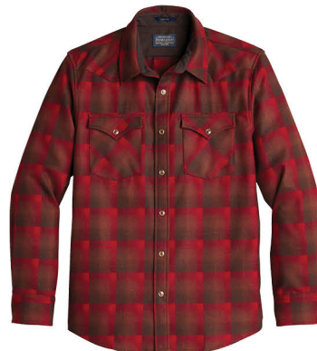
9/25 RA642-32495 AA848-32495 Tall Red/Brown Ombre