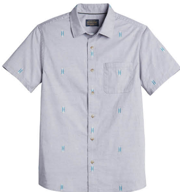
5/25 RA566-79267 Ocean Grey