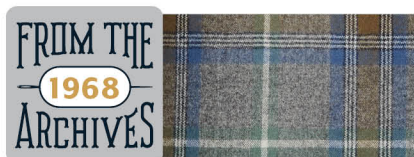
32484 Grey Mix/Green/Blue Plaid