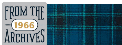
32498 Blue/Black/Turq Ombre

These plaids were inspired by favorites from the Pendleton fabric archives. On wool shirts made with these patterns, look for a "From the Archives" hangtag, and a blue placket label with the year of the plaid's first release.