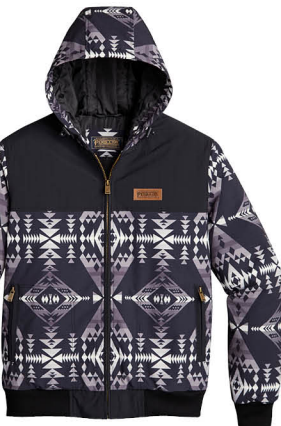
8/25 CM228-83224 Diamond Peak Black/Grey