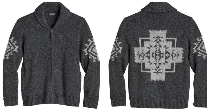
8/25 RF789-74186 Chief Joseph - Charcoal