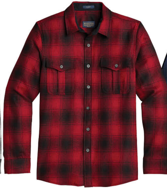
8/25 RA551-32347 Red/Black