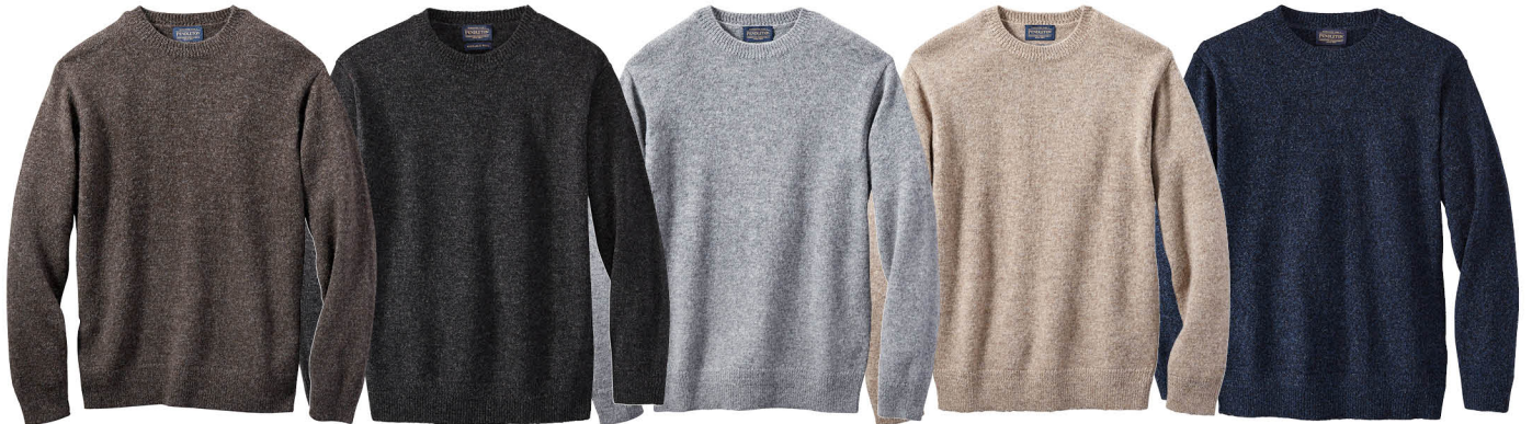
7/25 RF532-61411 Dark Brown Mix