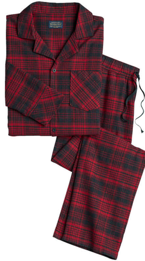
9/25 AP701-79278 Red/Fir Plaid