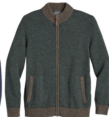
9/25 RF771-74174 Brown Mix/Deep Green