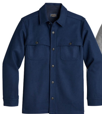
7/25 RK373-28371 Classic Navy