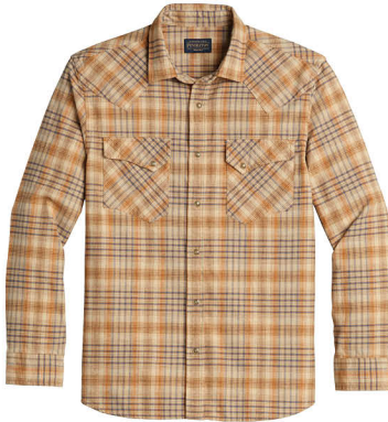
8/25 RA547-79238 Tan/Blue Plaid

Inspired by our vintage Gambler shirt. Premium snap closures, peaked front and back bias yoke details, distinctive angled bias pockets with flaps, shirttail hem. Machine washable, 100% cotton, imported, hanging, 5.4 oz.