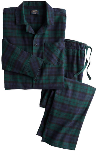
9/25 AP701-79318 Black Watch Tartan

A soft flannel set for cozy nights. Long sleeve PJ shirt has spread collar, open pocket, and button closures. Cotton pant has side-seam pockets and tie waist. Machine washable, 100% cotton, imported.