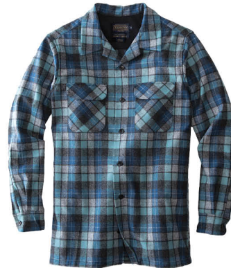
5/25 AA022-30789 AA800-30789 Tall Blue Original Surf Plaid