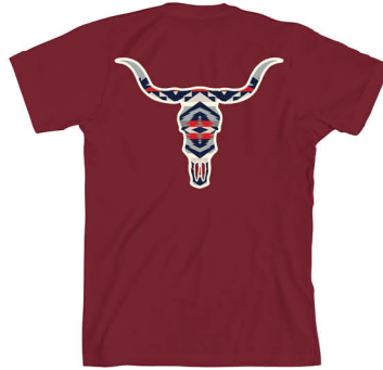
TECOPA HILLS LONGHORN