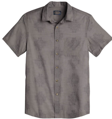
5/25 RA849-79307 Chief Joseph - Smoke