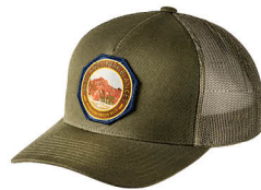
GMI02-54572 Army (Badlands)