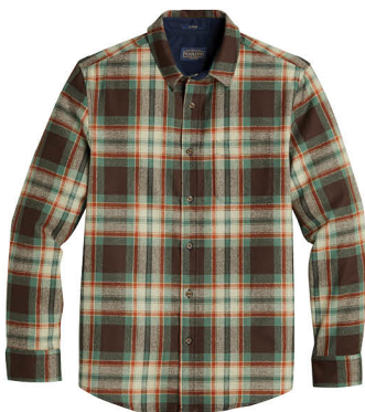
9/25 RA643-32491 AA849-32491 Tall Brown/Aqua Block Plaid