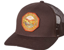
GMI02-54906 Brown (Great Smoky Mountains)