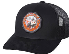
GMI02-54907 Black (Acadia)