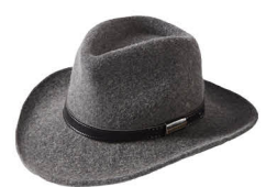
GS010-54852 Charcoal Mix