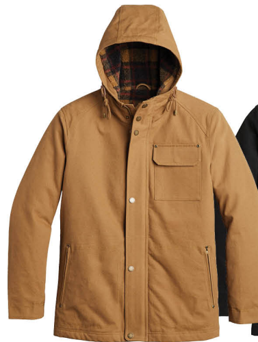
8/25 C2024-83208 Saddle

PENDLETON DRY GOODS C2024 S - 2XL $225.00