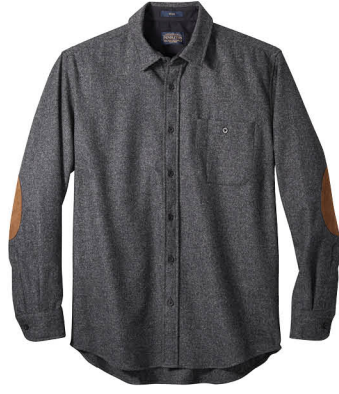
5/25 RA637-28347 Oxford Mix