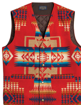
7/25 RK793-16071 Chief Joseph - Red