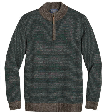
9/25 RF772-74174 Brown Mix/Deep Green

SHETLAND FULL ZIP SWEATER Mock neck, leather zipper pull, welt pockets. Machine washable, 100% Shetland wool, imported.