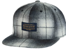
GMI39-32501 White/Black Ombre available 7/25/22