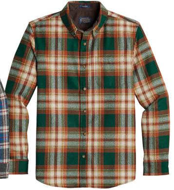
9/25 RA645-32490 Green/Copper Block Plaid