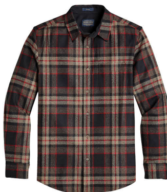
9/25 RA643-32489 AA849-32489 Tall Brown Mix Block Plaid