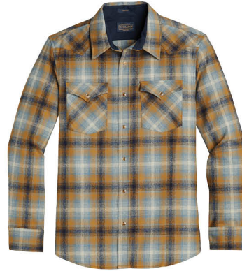
5/25 RA642-32487 AA848-32487 Tall Blue/Copper Ombre