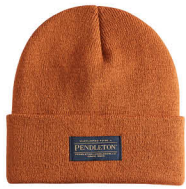
GS787-54918 Burnt Orange

Made in USA with imported materials, 100% Acrylic, hand wash, one size