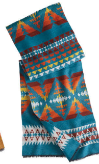
GR640-54248 Summit Peak