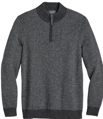
9/25 RF772-74171 Charcoal/Black