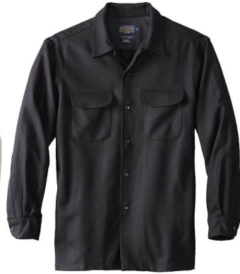
5/25 RA335-20042 AA826-20042 Tall Black