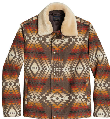
9/25 RK765-16075 Misson Trails - Brown