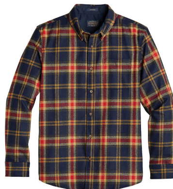
9/25 RA645-32483 Navy/Red/Gold Block Plaid