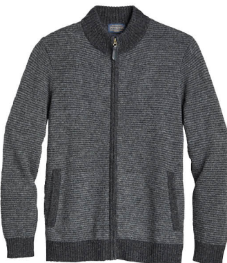
9/25 RF771-74171 Charcoal/Black