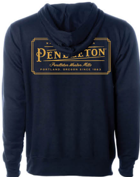
HERITAGE LOGO HOODY