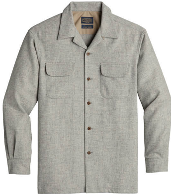
5/25 RA742-32502 RA791-32502 Tall Dark Natural