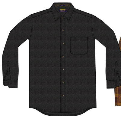
7/25 RA839-28347 Oxford Mix