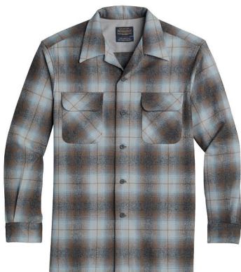
5/25 RA790-32497 AA800-32497 Tall Oxford/Tan/Blue Ombre