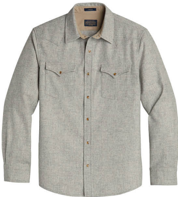
9/25 RA837-32502 Dark Natural