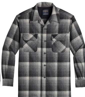
5/25 RA790-32506 AA800-32506 Tall Grey/Oxford Ombre