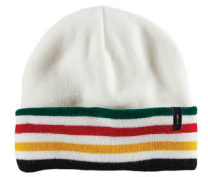
GS803-54813 Glacier not available in Canada available 11/25/21