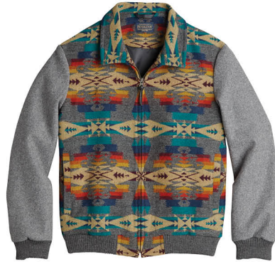
5/25 RK785-16070 Tucson - Grey Mix