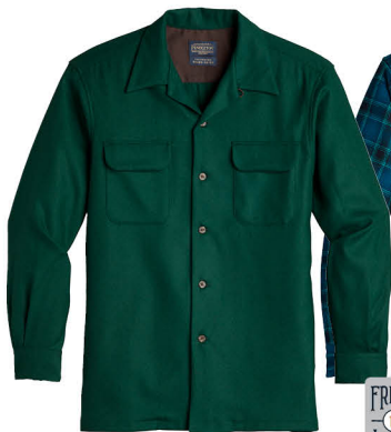
9/25 RA742-32512 Green