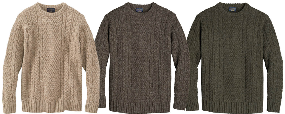
9/25 RF481-61484 Coyote