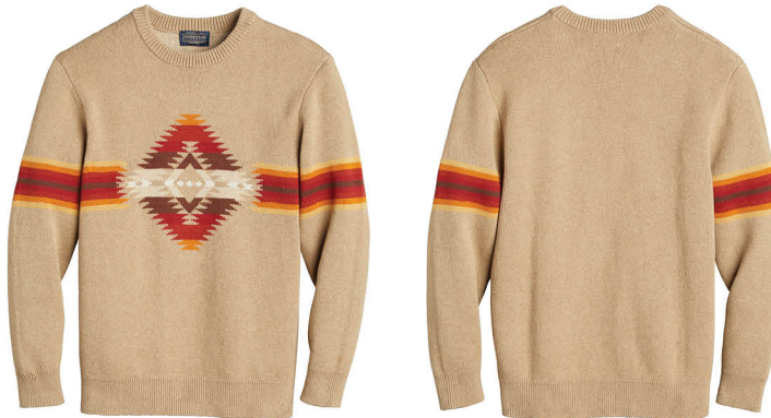
5/25 RF795-74183 Mission Trails - Tan