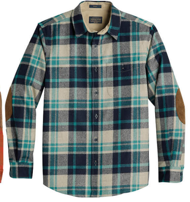
5/25 RA638-32485 Tan Mix/Teal/Navy Plaid