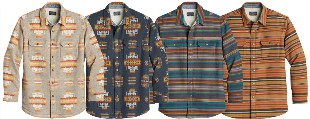
7/25 RK591-81880 Chief Joseph - Tan

RK591 S - 2XL $269.00 RK590 S - 2XL $269.00