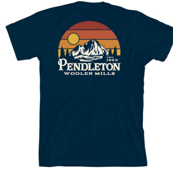
MOUNTAIN VIEW LOGO

7/25 RG887-74218 Midnight Navy 100% cotton