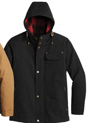
8/25 C2024-83129 Black