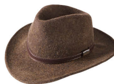
GS010-54506 Olive Mix