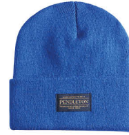
GS787-54919 Electric Blue