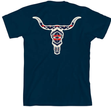
TECOPA HILLS LONGHORN

7/25 RG895-74230 Midnight Navy 100% cotton