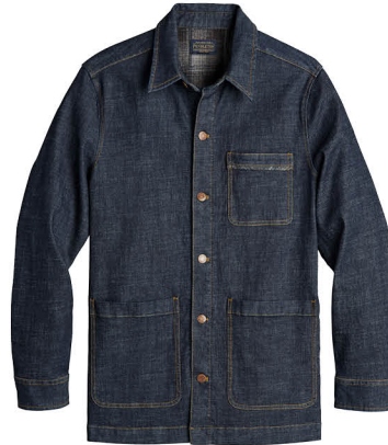
5/25 RK825-81867 Denim Blue