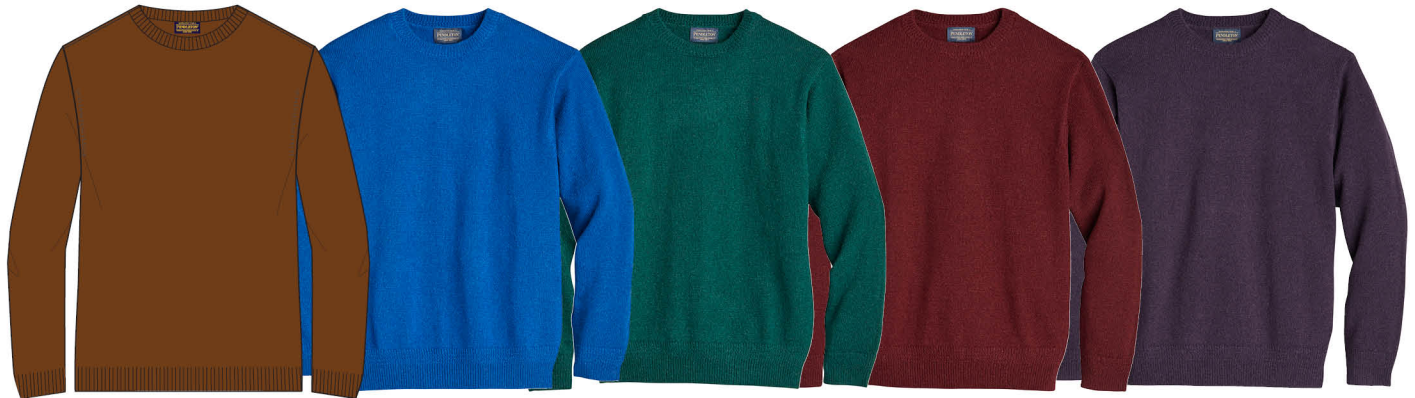
7/25 RF532-74167 Terra Cotta