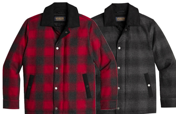
8/25 CM220-83036 Red Ombre