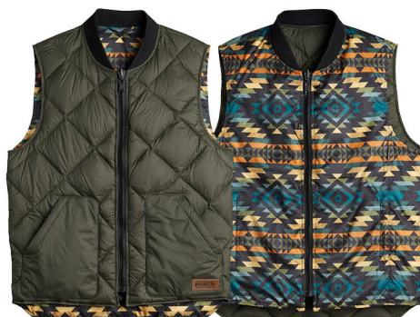
8/25 CM028-83223 Pueblo Dwelling Black