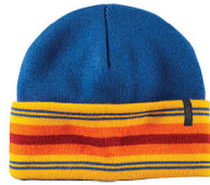
GS803-54815 Grand Canyon