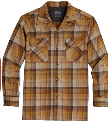
7/25 RA790-32480 Copper/Red Ombre