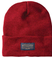
GS787-54900 Red Heather