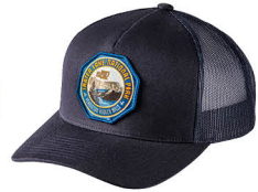
GMI02-54590 Navy (Crater Lake)