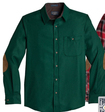
9/25 RA838-32512 Green