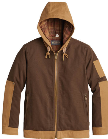
8/25 C2217-83146 Brolive

PENDLETON DRY GOODS C2217 S - 2XL $215.00