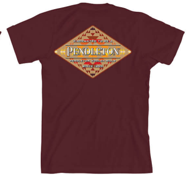
MISSION TRAILS DIAMOND