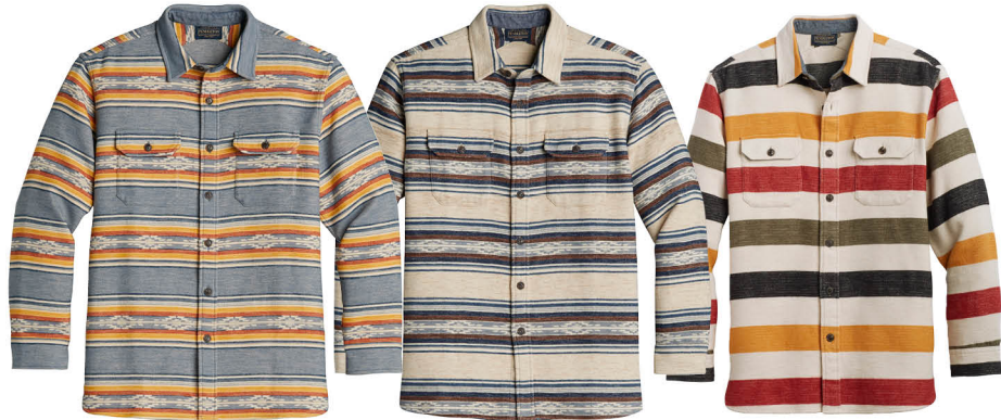
7/25 RA475-81883 Denim Saltillo Stripe

RA475 S - 2XL $199.00 RA583 S - 2XL $199.00