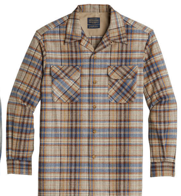
5/25 RA790-32486 Brown/Blue/Gold Multi