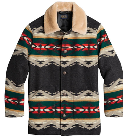
8/25 RK844-16069 Tecopa Hills - Black