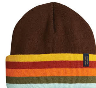
GS803-54915 Great Smoky Mountains