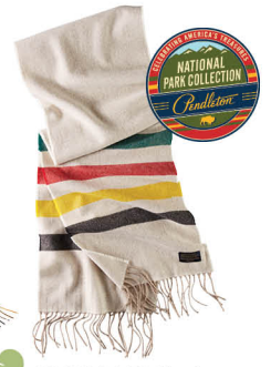
GR629-54612 Glacier not available in Canada

GR640 Jacquard Scarf fringe 0.5" 76" x 12" $94.50