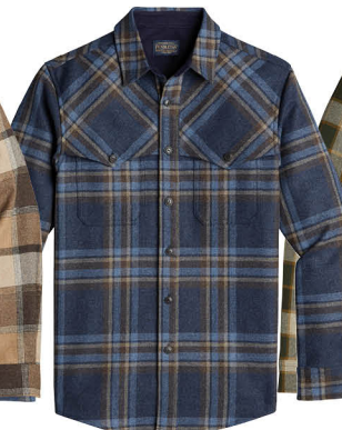
8/25 RA634-32517 Navy Mix/Brown Mix Plaid