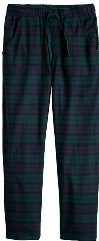
9/25 AP702-79318 Black Watch Tartan

Soft flannel pant has side-seam pockets and tie waist. Machine washable, 100% cotton, imported.