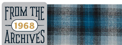
32505 Blue/White/Black Ombre