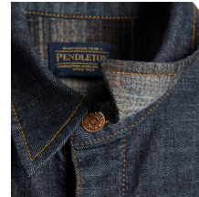
Wool Trim at Collar