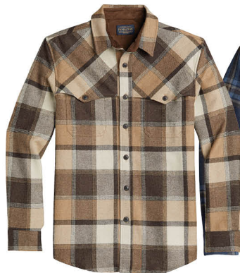
8/25 RA634-32516 Ivory/Brown Mix Block Plaid