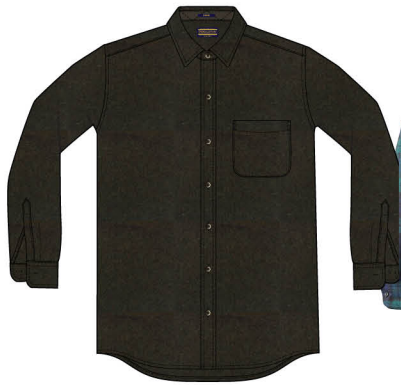
5/25 RA839-28172 Peat Moss Mix