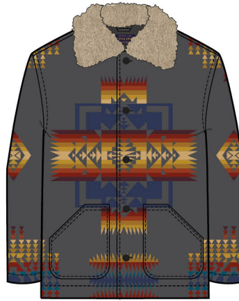
8/25 RK848-16078 Chief Joseph - Dark Grey

RK848 S - 2XL $549.00 RK844 S - 2XL $549.00