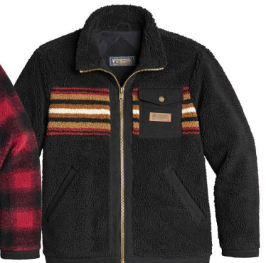
8/25 C2112-83205 Black/Red Stripe