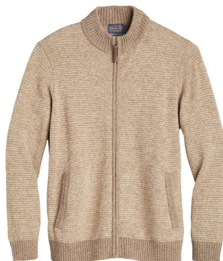
9/25 RF771-74172 Coyote/Tan