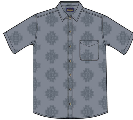
5/25 RA849-79317 Chief Joseph - Blue