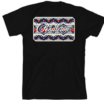
TECOPA HILLS LOGO