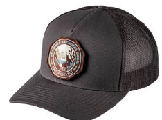
GMI02-54589 Charcoal (Olympic)