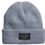
GS813-54890 Lt Heather Grey