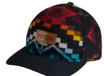
GMI37-16087 Carico Lake

GMI37 Pendleton Wool Hat 5 panels, hard interfacing, medium curved brim, snap-back closure. Imported, 60% Cotton, 40% Polyester, spot clean $39.50