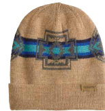
GS764-54759 Harding Taupe