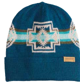
GS764-54930 Harding Aegean