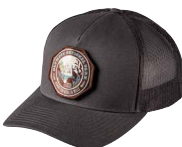
GM102-54589 Charcoal (Olympic)

100% Cotton, imported, spot clean, one size