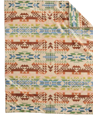
ZE475-55340 Available 01/25/23

The Medicine Bow River rises deep in Wyoming's Snowy Range to flow 167 miles on its way to the Medicine Bow Mountains. Native tribes traveled to the area to harvest mountain mahogany for especially fine bows. Stands of wood alternate with bands of arrows, meeting in the center to show the Medicine Bow River crossing, an important link between East and West. Unnapped, felt binding.