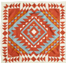
GS293-54255 Smith Rock Tan