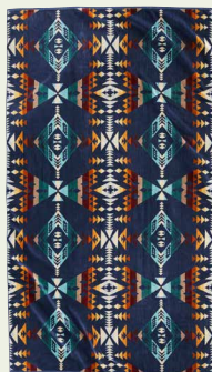
XB233-53590 Diamond Peak Available 01/25/23