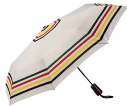
GZ908-54091 Glacier Park Stripe not available in Canada

GZ908 Umbrella Auto open feature 42" canopy | 107cm canopy $34.50