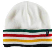
GS803-54813 Glacier not available in Canada

A portion of sales supports the National Park Foundation.