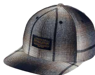
GMI39-32550 Grey Brown Mix Ombre

GMI39 Flat Brim Hat 6 panels, hard interfacing, flat brim, snap-back closure, body & top visor, 100% Virgin Wool, bottom 100% Cotton $34.50