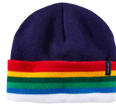
GS803-54814 Crater Lake