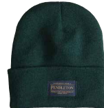
GS787-54740 Hunter Green