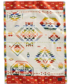
ZM609-57054 Available 01/25/23

Wildflowers are vivid symbols of summer in America's Appalachian Plateau. This bio-diverse region blooms with an array of beautiful flowers from March to October. In this pattern, stylized Asters, Harebells, Gentians, Trilliums, and more, are interpreted by the loom, where their beauty can blossom all year round.