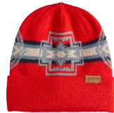
GS764-54931 Harding Red