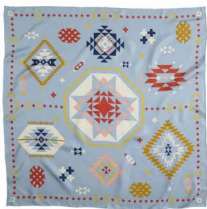
GS293-54682 Wild Blossoms Blue

Soft silk scarves and generously sized bandanas and have you covered. available 10/25/22