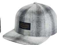
GMI39-32546 Grey Mix Ombre

GMI37 Pendleton Wool Hat 5 panels, hard interfacing, medium curved brim, snap-back closure. Imported, 60% Cotton, 40% Polyester, spot clean $39.50