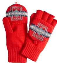
GS797-54931 Harding Red