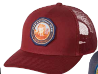
GM102-54703 Maroon (Zion)