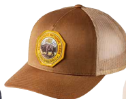
GM102-54573 Dark Tan (Yellowstone)