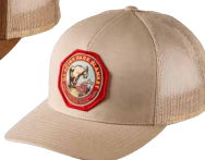
GM102-54592 Natural (Glacier)