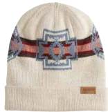
GS764-54929 Harding Ivory

GS764 Knit Beanie Available 10/25/22 $54.50