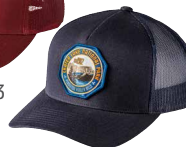
GM102-54590 Navy (Crater Lake)