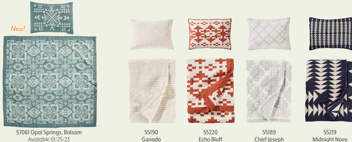
57061 Opal Springs, Balsam Available 01/25/23