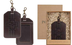
GZ964-54601 Dark Brown Luggage Tag Embossed front, clasp with keyring, ID window 2.75 x 4.25" | 7 x 11cm $34.50