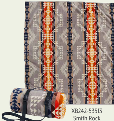
XB242-53513 Smith Rock Available 01/25/23