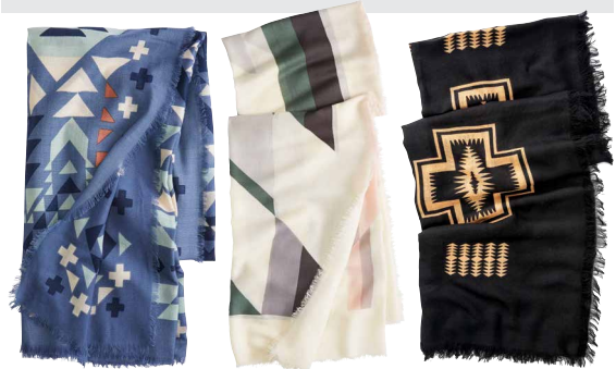
GS699-54696 Opal Springs Denim Available 1/25/23

Imported, 100% Mercerized Wool, dry clean, available now unless otherwise noted