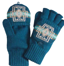
GS797-54930 Harding Aegean