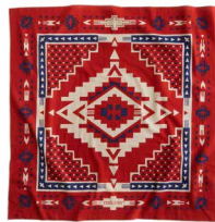
GZ970-54681 Carico Lake Red

GS293 Silk Scarf Imported, 100% Silk, dry clean 35 x 35" | 89 x 89cm $74.50