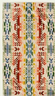
XB233-55340 Opal Springs Available 01/25/23

Machine washable. 100% Cotton. Imported.