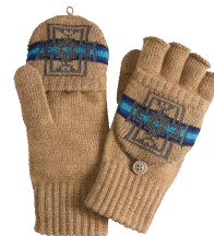
GS797-54759 Harding Taupe