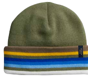
GS803-54411 Rocky Mountain