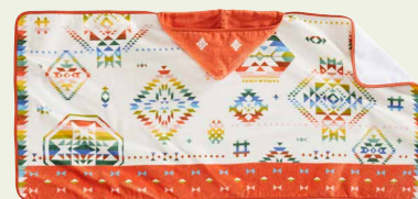
XB263-57054 Wild Blooms Available 01/25/23

Printed Hooded Baby Towel , 100% Cotton exclusive of embroidery, 480 GSM. 23 x 48" + hood | 58 x 122cm $39.50