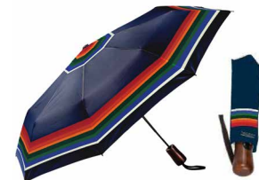
GZ908-54896 Crater Lake Stripe