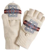
GS797-54929 Harding Ivory

GS797 Convertible Fingerless Mittens S/M L/XL $49.50