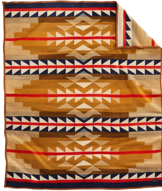
ZE493-57046 Available 01/25/23