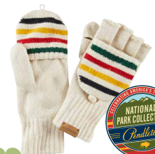
GS797-54821 Glacier Stripe not available in Canada