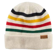
GS764-54821 Glacier Stripe not available in Canada

GS797 Convertible Fingerless Mittens S/M L/XL $49.50