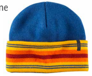
GS803-54815 Grand Canyon