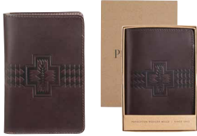
GE260-54601 Dark Brown Passport Holder Embossed front, multiple card slots 4.25 x 6 x .5" | 11 x 15 x 1cm $59.50

Each sold in individual gift box, imported, 100% Leather, 100% Polyester Lining, clean by leather specialist, available 10/25/22